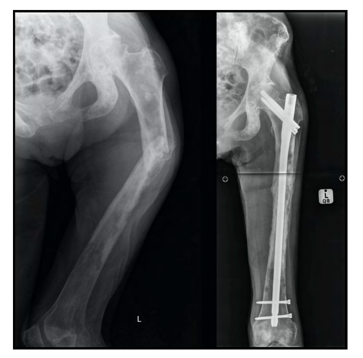
Figure 3. A 68-year-old patient with metastatic breast cancer who sustained a left diaphyseal femoral fracture. Radiographs pre- and post-cephalomedullary nailing

Data was recorded regarding demographics, primary pathology, location of lesion, type of surgery and implant used. The incidence of complications including radiological failure of fixation, infection, thromboembolic phenomena, re-operation, and mortality were recorded. Mortality was considered perioperative if within 48 hours of the procedure, early postoperative if within one month, or late if after one month. Patients with incomplete records were excluded.