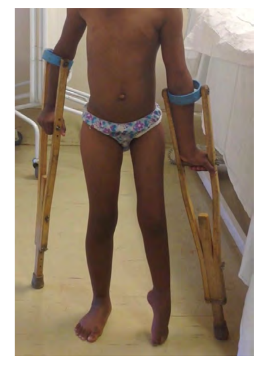
Figure 6 . Clinical picture in the frontal plane demonstrating hypoplasia of the left lower limb, genu valgus and equinovarus foot deformity, all classic features of polio

Several limitations of our study warrant consideration. Due to the rarity of the syndrome we were able to identify only a small number of cases. We were unable to confirm a history of AFP in all but one child. This may be explained by a situation where the meningitic nature of a febrile illness was not appreciated. A mild neurological deficit, especially in young children, can easily be missed. As the subsequent clinical course is that of progressive