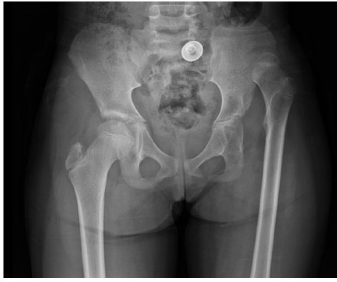
Figure 3. AP pelvis X-ray showing left hip dislocation with acetabular dysplasia and hypoplastic proximal femur

months until up to two years. No recovery occurs after this in the residual paralysis phase. Residual paralysis following enterovirus infection may be mild. Asymmetric weakness and incomplete recovery of paralysis result in muscle imbalance. In the growing child, active muscles shorten, and paralysed muscles overlengthen. Over time this results in altered bone growth and joint contractures. A greater disparity in strength will result in earlier deformity. A mild discrepancy, however, over a long period, will also result in deformity, altered growth and joint development. These deformities often manifest years after the initial paralysis and are recognised as the typical manifestations of paralytic polio.<sup>10</sup>