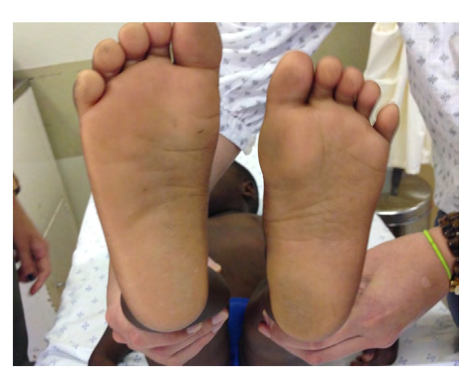
Figure 7. Clinical picture showing hypoplasia of the left foot in patient 3