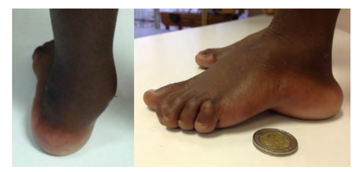
Figure 1. Clinical images in the frontal and sagittal plane demonstrating calcaneo-cavo-valgus foot deformity