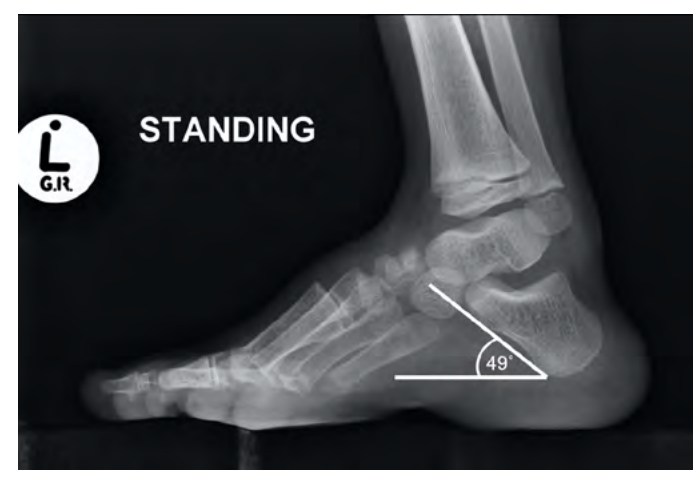
Figure 2. Lateral X-ray demonstrating calcaneo-cavus deformity with calcaneal pitch measured at 49^\circ

Figure 1. Clinical images in the frontal and sagittal plane demonstrating calcaneo-cavo-valgus foot deformity