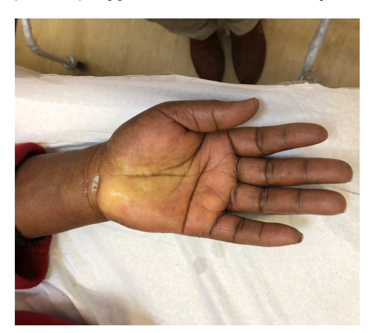
Figure 3. Blanching after carpal tunnel infiltration

Patients were operated in a sterile field, prepping the hand with chlorhexidine and alcohol. Three towels or drapes were used per procedure (two to drape, and one rolled-up towel as positioner under the hand), as well as sterile gloves and masks. The surgeons were not gowned or capped. During the procedure, the surgeon communicated with the patient, relying on verbal feedback. No vital signs were monitored during the process. The resuscitation trolley was within reach and regularly checked. Sterile dressings were placed, comprising gauze without the use of elastic bandages. No