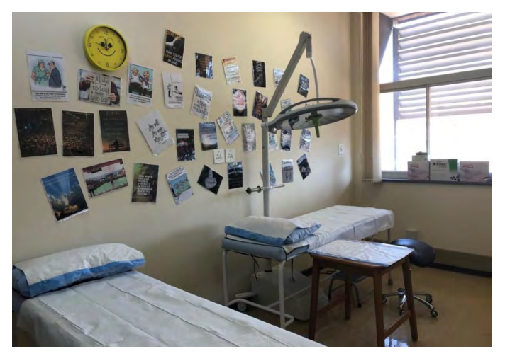
Figure 1. Image of WALANT theatre room in the orthopaedics outpatient department

Therefore, the objective of the current study was to establish a subjective patient experience with WALANT procedures performed at the institution from May 2019 to March 2020. The secondary objective was to assess if there were any differences in the level of pain during carpal tunnel and trigger finger release, or between males and females.