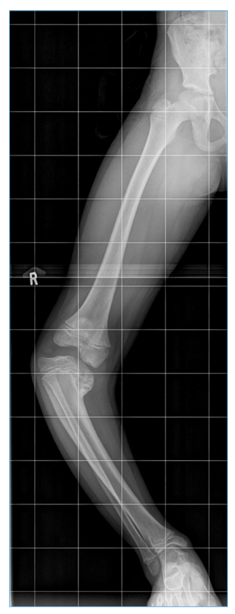
Figure 3 . Standing antero-posterior (AP) radiograph of a 9-year-old female patient with Langenskiold stage VI late-onset Blount's disease of the right limb