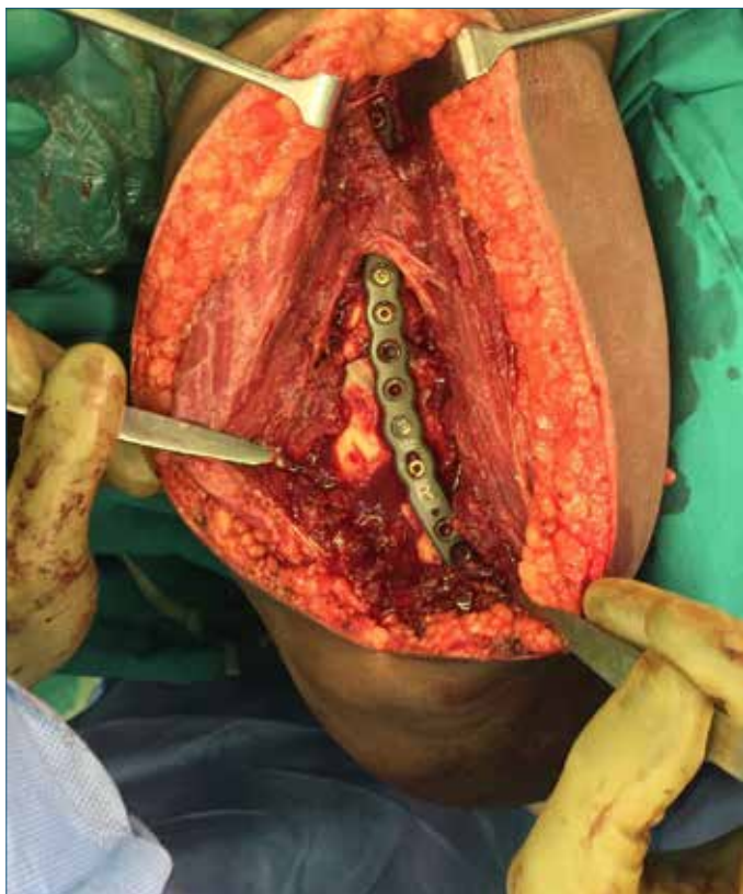
Figure 5. Intra-operative view of posterolateral plate; white arrow shows radial nerve overlying plate

and protected. Fracture fragments were manipulated and reduced under direct visualisation and temporarily fixed with K-wires. Interfragmentary screws were applied as required, following which a Stryker Variax (Michigan, USA) posterolateral distal humerus locking compression plate was used to fix the fracture ( Figure 5 ). The plate used in all fracture fixation cases had five distal locking holes which were filled. Depending on the fracture configuration and the presence of interfragmentary screws, the metaphyseal and diaphyseal plate holes were filled accordingly. The absence of olecranon impingement was determined intra-operatively. Surgical time was documented from the time of skin incision to completion of skin closure.