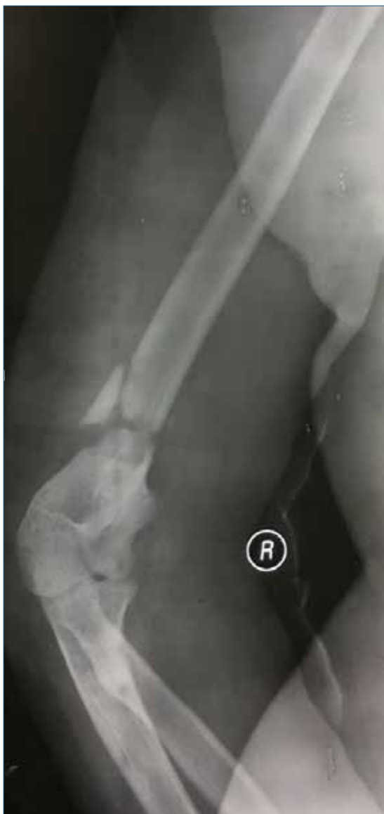
Figure 2. Pre-operative fracture X-ray

The operations were performed under general anaesthesia with the patient positioned prone with the affected arm placed over an arm support. A tourniquet was not used. A midline, posterior triceps splitting technique was used. The radial nerve was identified