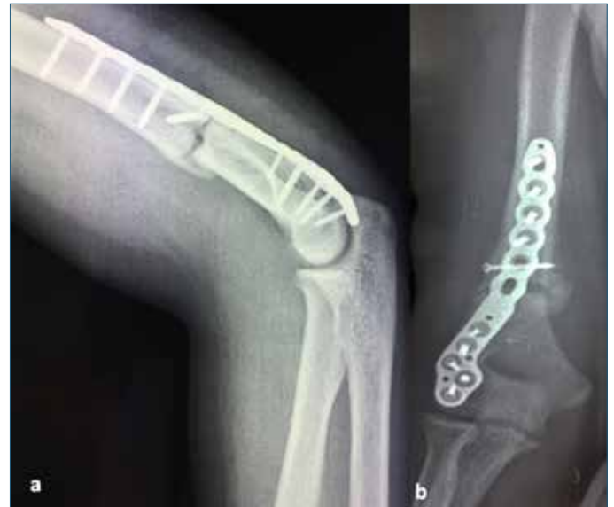
Figure 3. a) Lateral view and b) antero-posterior view (AP) at 6 weeks after posterolateral plating