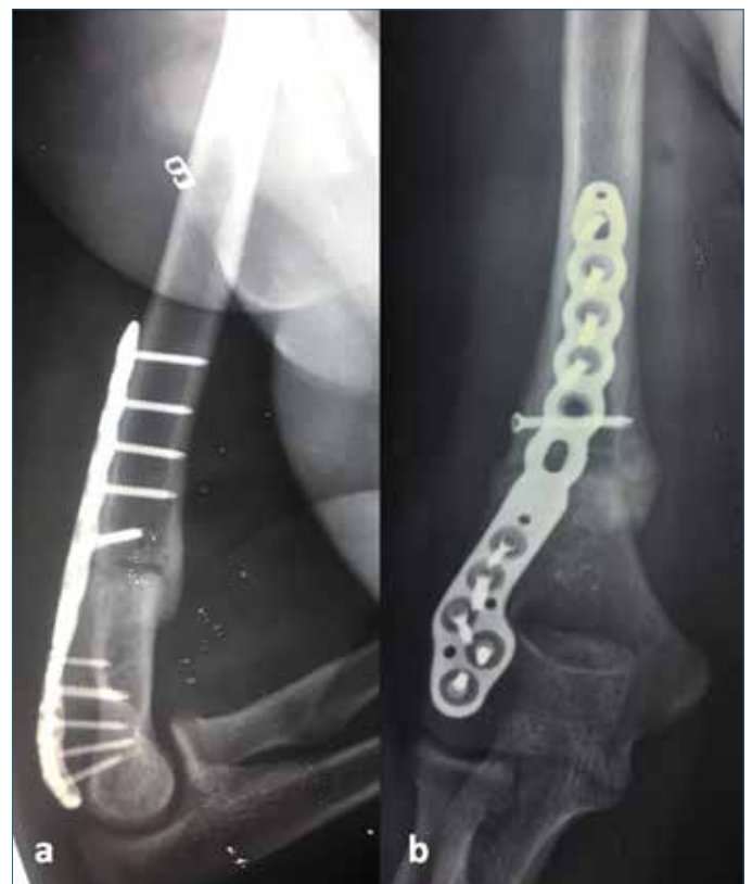
Figure 4. a) Lateral view and b) AP view at 12 weeks after posterolateral plating