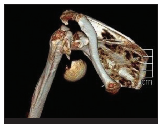
Figure 2. 3D CT scan of 5-month-old fracture dislocation with tuberosity malunion

Sirveaux et al. ,<sup>23</sup> in a prospective multicentric study, report improved anterior active elevation with RTSA compared to hemiarthroplasty (mean of 113° vs 88°).