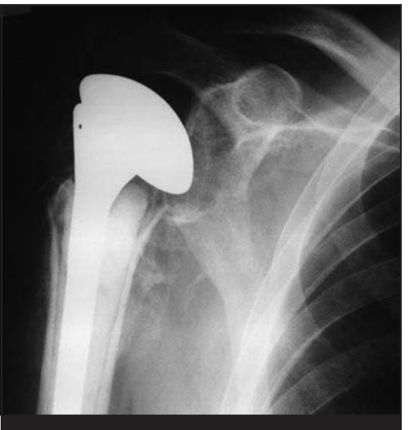
Figure 1. Hemiarthroplasty with greater tuberosity non-union and superior migration

In the early 1950s, Neer introduced hemiarthroplasty for the treatment of proximal humerus fractures at high risk of AVN. Although he and others have published good results with this, it is understood that elderly patients have worse outcomes with hemiarthroplasty than their younger counterparts. Clinical outcome is reliant upon the prosthesis height and version, and tuberosity position and union; however, in some studies up to 50% tuberosity malpositioning is seen, which can result in superior migration, stiffness, weakness, pain and lower functional scores ( Figure 1 ).<sup>9,10</sup>