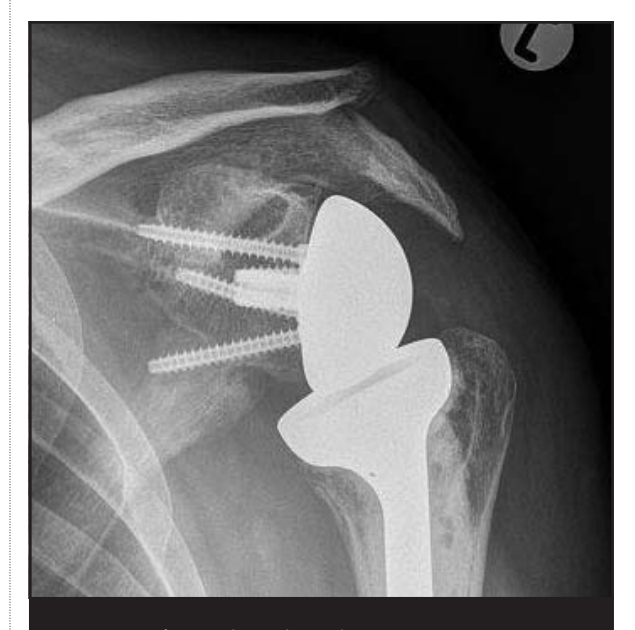
Figure 3. Inferior glenoid notching

Notching ( Figure 3 ) refers to the loss of bone from the inferior pole of the scapular neck. The cause is a mechanical impingement of the medial aspect of the humeral component on this area when the arm is adducted.<sup>39</sup> The mechanical impingement may cause polyethelene wear leading to focal osteolysis and notch progression.<sup>40</sup>