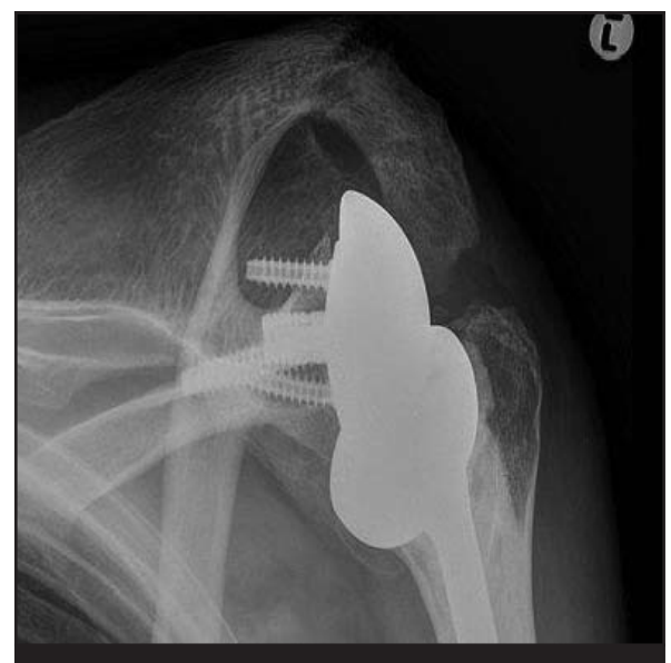
Figure 5. Axillary view of acromial fracture post RTSA

Acromial fractures ( Figure 5 ) complicate between 1 and 7% of RTSA. They have been classified by Crosby and Hamilton<sup>46</sup> into three groups depending on the anatomic location. Types 1 and 2 are lateral to the acromio-clavicular joint, and type 3 is medial. The type 3 fractures commonly involve the spine of the scapula and are related to screw position.