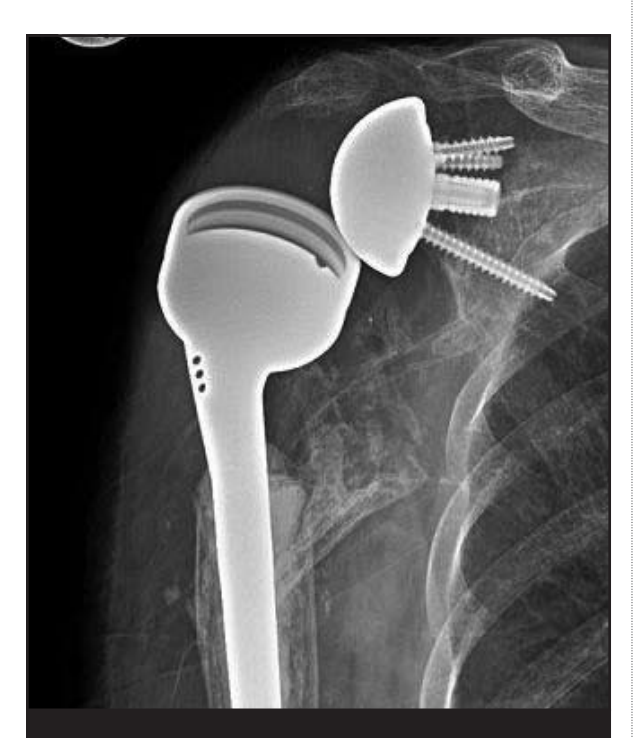
Figure 4. Instability post RTSA

Other authors have investigated the effect of lateralisation of the centre of rotation on glenoid notching. Boileau et al. <sup>42</sup> utilised a composite bone graft and component, while Valenti et al. <sup>43</sup> investigated a modified glenoid component that lateralised the centre of rotation without the need for bone grafting. While the latter showed neither notching nor glenoid loosening in 76 shoulders at a minimum of two-years' follow-up, there remain concerns regarding the resultant increase in torque and shear forces associated with lateralisation that may increase the rate of glenoid component loosening.