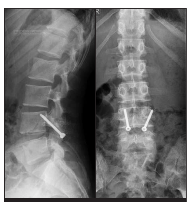
Figure 4. Bucks screws