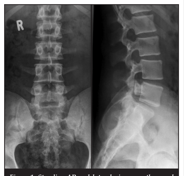
Figure 1. Standing AP and lateral views are the usual screening investigations when evaluating lower back pain

Bone scan and SPECT : Bone scan and SPECT show increased sensitivity over X-rays; however, their specificity is often low. They do have prognostic value whereby a 'cold scan' of a radiological pars fracture represents a non-union and a positive scan represents active healing or healing potential.