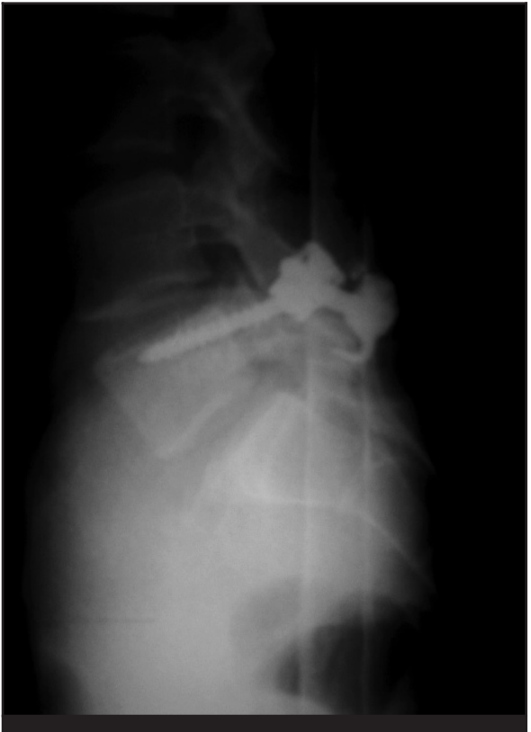
Figure 5. Pars repair with pedicle screw and sublaminar hook