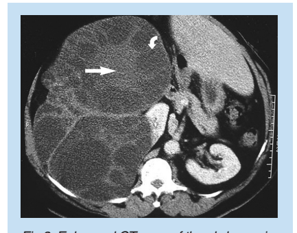
Fig.3. Enhanced CT scan of the abdomen in a different patient showing the typical 'wheel spoke' appearance of a type II cyst in the right kidney. The daughter cysts (curved arrow) are of lower attenuation than the mother cyst and are arranged along the periphery. The mother cyst has a matrix with a density of 35 HU (arrow).

CT may display the same findings as ultrasound. The cyst fluid is usually of water attenuation unless complicated by super-added infection. The cyst wall is usually well defined except in super-added infection, with variable nonspecific contrast enhancement.<sup>8</sup> The classic 'wheel spoke' appearance described on ultrasound is also seen on CT scanning (Fig. 3).<sup>11</sup>