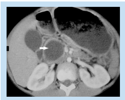
Fig. 2a. Axial enhanced CT demonstrates a 4 \times 2 cm type 1 hyatid cyst in the pancreas (arrow). The dilated debris-filled stomach and compressed second part of the duodenum are also seen.