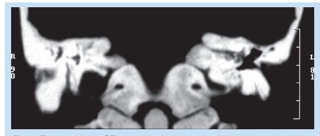
Fig. 2. Temporal bone CT scan showing narrowing in both internal auditory canals and constriction of the contents of both otic capsules.

raised serum alkaline phosphatase; however, serum calcium, full blood count, urea and electrolytes were all normal. Imaging studies of the skull (Fig. 1) and lumbar and thoracic spine radiography showed generalised thickening and bony sclerosis in keeping with the diagnosis of osteopetrosis.