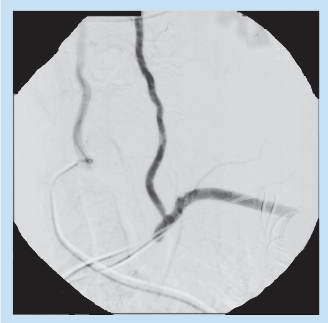
Fig. 5. Digital subtraction angiogram demonstrating LSA opacification due to retrograde flow from the left vertebral artery (as a subclavian artery steal phenomenon).