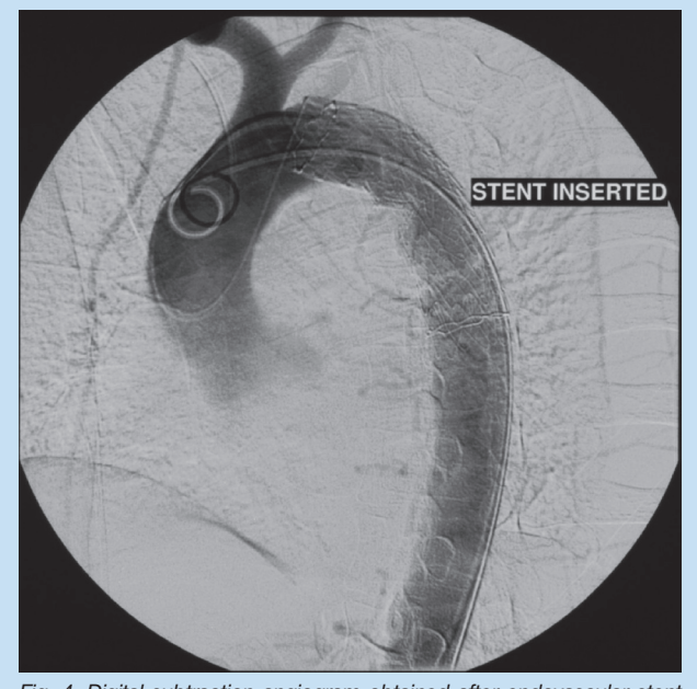
Fig. 4. Digital subtraction angiogram obtained after endovascular stent graft deployment, demonstrating complete exclusion of the pseudoaneurysm and occlusion of the origin of the LSA.