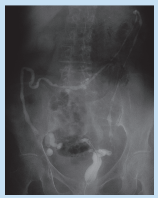
Fig. 1. Water-soluble enema demonstrating a super 'lead pipe' colon.

Histological examination revealed a florid acute(!) ulcerative colitis. The bowel was narrowed, with areas of stricture formation and marked bowel wall thickening (Fig. 2). Extensive mucosal ulceration with underlying inflamed granulation tissue was noted. The remainder of the non-ulcerated mucosa showed acute-on-chronic inflammatory cell infiltration with crypt-abscess formation, distorted glandular architecture, regenerative changes and gland loss (Fig. 3). No dysplasia or malignancy was seen. There was marked submucosal fat infiltration (Fig. 3).