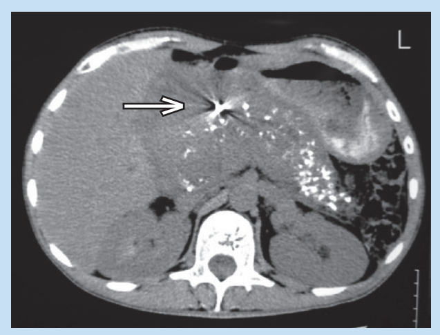
Fig. 2. Common hepatic artery angiography showing gastroduodenal artery pseudoaneurysm (arrow).