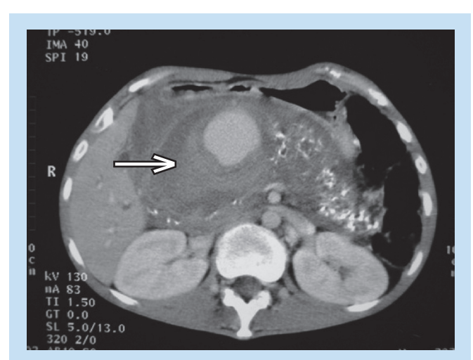
Fig. 1. Axial scan CT of upper abdomen demonstrating expansive mass in the pancreatic head (arrows) and extensive calcifications in pancreatic body and tail.

A 31-year-old man with a history of alcohol abuse was admitted to our hospital with recurrent episodes of epigastric pain, haematemesis and melena. He reported a weight loss of 13 kg during the preceding month.