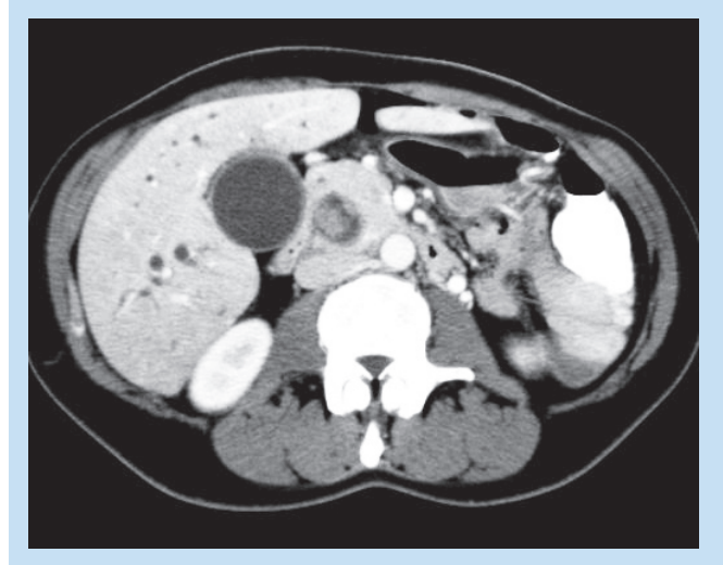
Fig. 2. Abdominal CT in the portovenous phase demonstrating a distended gallbladder, severe intra/extra hepatic bile duct dilatation and a lobulated, enhancing mass in the distal common bile duct in keeping with a cholan-giocarcinoma.

pathology demonstrated on CT is pancreatitis and pancreatic adenocarcinoma.<sup>15</sup> Adenocarcinoma is the most common malignant pancreatic tumour, affecting the head of the pancreas in 60 - 70% of cases.<sup>16</sup> Today, CT is the most commonly used imaging method in the assessment of pancreatic tumours.<sup>17</sup> On imaging the primary tumour is a hypoattenuating mass, usually well visualised on the pancreatic phase (a circulation phase corresponding in timing to the late arterial/portal vein inflow phase, when the pancreatic parenchyma is enhanced more than hepatic parenchyma)<sup>15</sup> (Figs. 1a and b). Cephalocaudate coverage for the pancreatic phase, as used by W Dennis Foley, is from the diaphragm to the