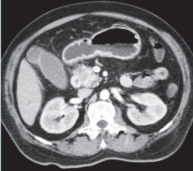
Figs 1a and b. Adenocarcinoma of the uncinate/head of pancreas. Fig. 1a. Abdominal CT in the late arterial phase demonstrating a dilated pancreatic duct as well as common bile duct. The body and tail of the pancreas appear atrophic. Fig. 1b. An ill-defined low-density mass is present in the head/uncinate process of the pancreas. Note clear separation from the SMA and SMV,

but close approximation to the duodenum. No regional lymphadenopathy is present.