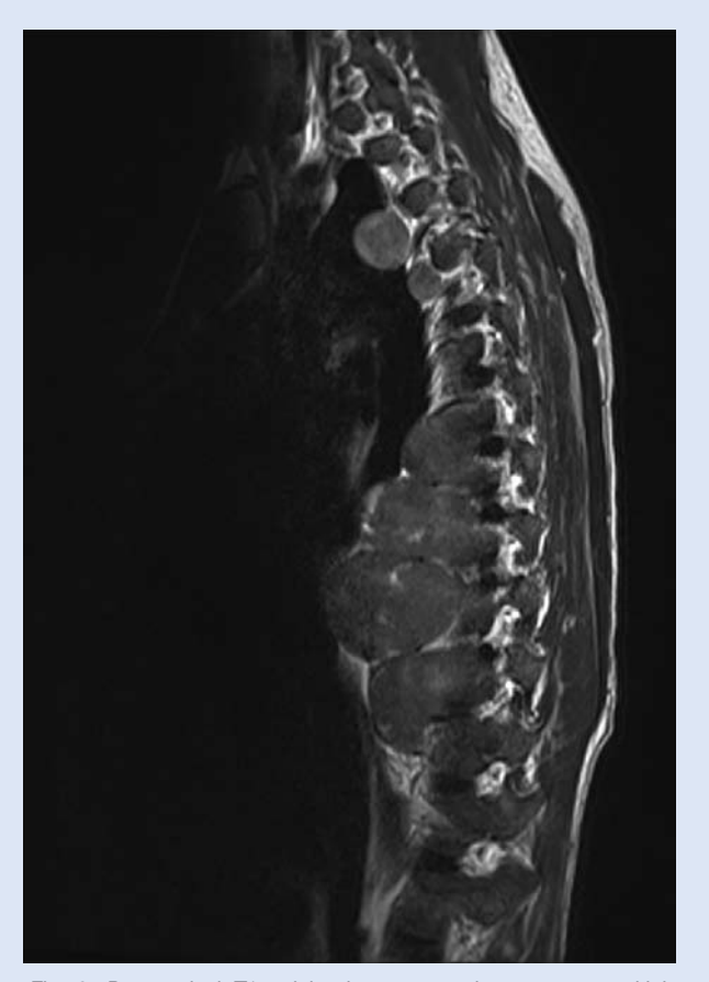
Fig. 3. Para-sagittal T1-weighted sequence demonstrates multiple lobulated masses extending from the thoracic vertebrae which are iso-intense to the vertebral bodies. The masses extend laterally and anteriorly into the posterior mediastinum.

ribs, the underlying rib will be widened with a thin cortex.<sup>4</sup> On CT scan with contrast, extramedullary haematopoiesis lesions enhance inhomogeneously owing to the iron deposition and fat infiltration. As lymphadenopathy and neurogenic tumours enhance homogeneously and neurogenic tumours may have calcifications, these masses are differentiated from EMH masses.<sup>2</sup>