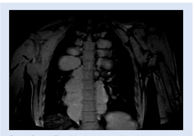
Fig. 4. Coronal T3-weighted sequence shows lobulated masses extending laterally into the posterior mediastinum, with similar signal to the adjacent vertebral bodies.