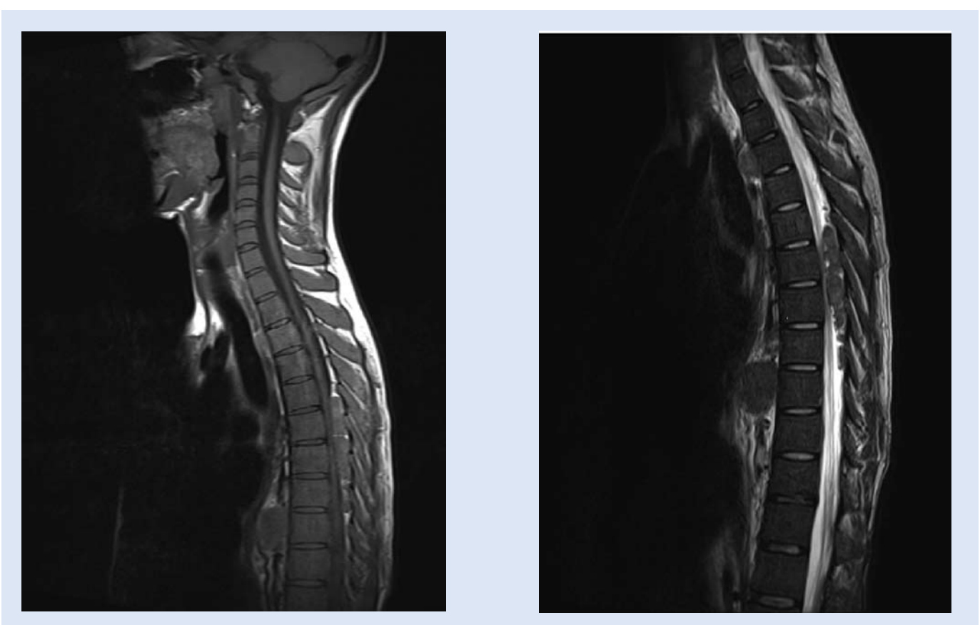
Fig. 2. Sagittal T1- and T2-weighted sequences demonstrate extradural lobulated soft-tissue masses which cause compression of the spinal cord at levels T5 - T8. These masses are iso-intense to the marrow within the adjacent vertebral bodies. There is enlargement of the central canal distal to the region of compression. There is also a mass anterior to the T9 vertebral body.

The patient also underwent magnetic resonance imaging (MRI) which showed extradural lobulated soft-tissue masses causing compression of the spinal cord at vertebral body levels T5 to T8 (Fig. 2). The mass lesions are iso-intense to the marrow within the adjacent vertebral bodies on T1- and T2-weighted sequences. The masses extend from the vertebral bodies laterally and anteriorly into the posterior mediastinum (Figs 3 and 4).