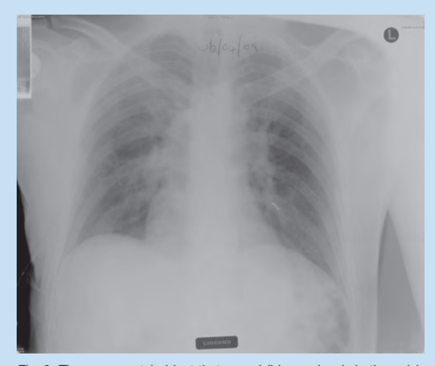
Fig. 3. The same metal object that was visible previously in the pelvis can now be seen in the left lower lung region.