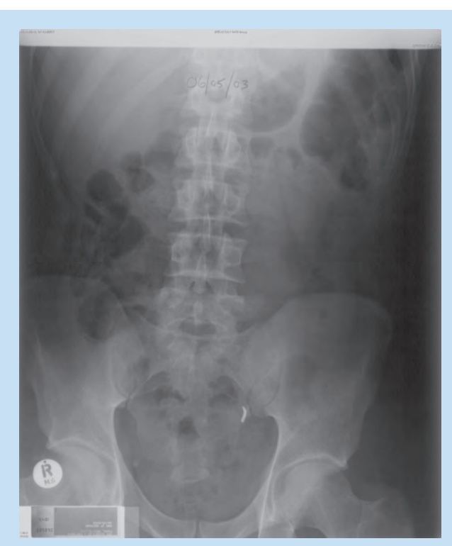
Fig. 1. X-ray of 2003 shows a metal foreign body in the pelvis.

The patient had a history of penetrating abdominal trauma; 6 years before, a metal projectile (a piece of wire) entered his pelvis during a farming accident. X-rays on 6 May 2003 confirmed a metal fragment in the pelvis. Six years later, on 4 April 2009, the patient was again involved in a farming accident and sustained facial bone fractures, contusion of the right lung, a right pneumothorax, as well as sacral and pelvic fractures. X-rays taken on 4 April 2009 revealed the same metal object as