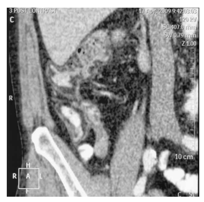
Fig. 1b. Coronal post contrast CT abdomen of the same patient with oral contrast demonstrates a low-attenuation fat layer in the wall of the caecum, ascending colon and terminal ileum. The patient did not have clinical or radiological features of inflammatory bowel disease, and the fat halo sign was a normal variant.

layer of muscularis propria/serosa (both being of soft tissue density) by a layer of fat (of low attenuation) measuring between -18 to -64 Hounsfield units.1-3