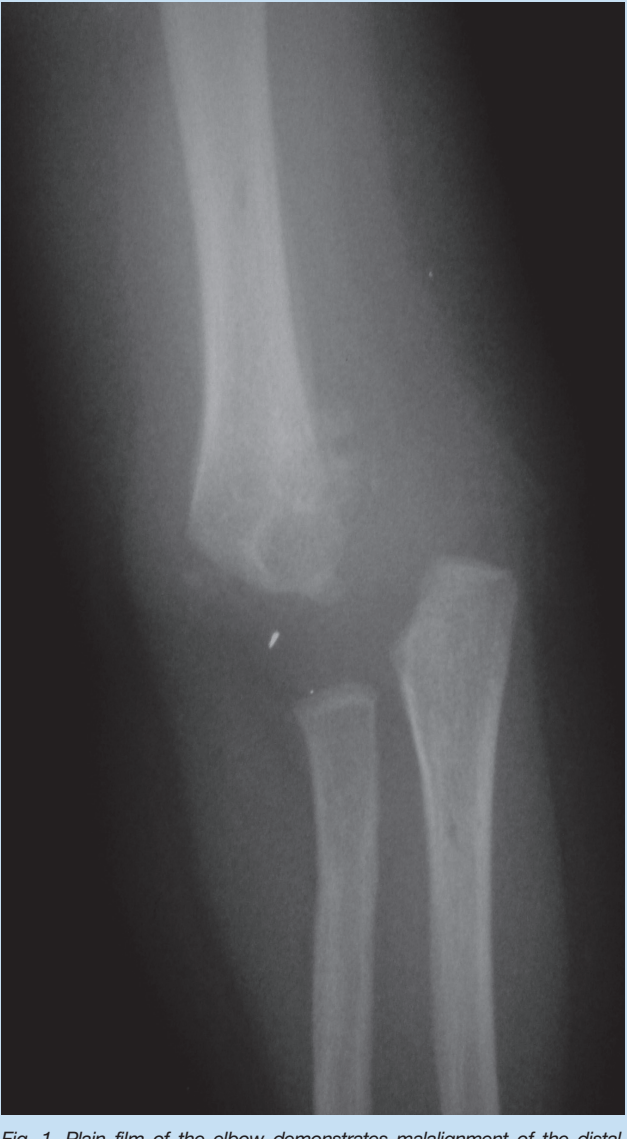
Fig. 1. Plain film of the elbow demonstrates malalignment of the distal humeral metaphysis with the proximal radial and ulnar metaphyses. The unossified epiphyses are not visible.