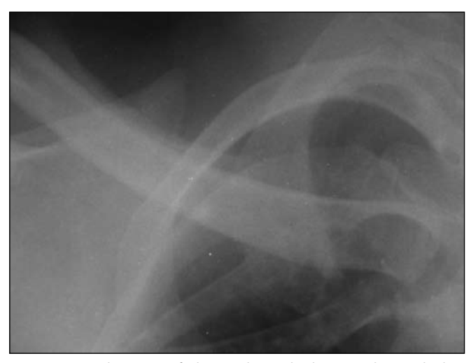
Fig. 2. Cropped section of chest radiograph showing abnormal rib splitting.