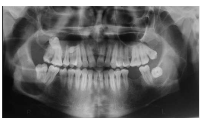
Fig. 1. Panoramic view showing cyst-like radiolucencies in all quadrants of the jaws. Note also impacted 3rd molars associated with the radiolucencies.

A 28-year-old abnormally tall man with forwardly displaced teeth presented to us. As part of pre-treatment evaluation, a panoramic radiograph was made. Well-defined cyst-like radiolucent areas which were associated with impacted third molars were observed in all quadrants of the jaw (Fig. 1). Evoking suspicion of a syndrome, a thorough general examination was performed. The patient had long, slender, fused fingers and toes, and multiple naevi measuring 2 - 3 mm over the skin. A chest radiograph revealed T1 splitting fusion and forking of the 3rd and 4th right ribs (Figs 2 and 3). A hand-wrist radiograph showed localised gigantism of the 2nd and 3rd digits with flexion deformity at the proximal metacarpo-phalangeal joints and soft