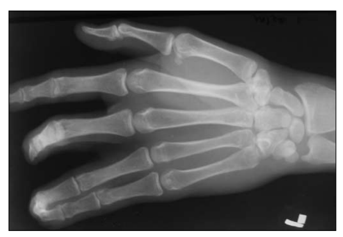
Fig. 4. Hand-wrist radiograph showing bony fusion of the terminal 4th and 5th terminal phalanges.

tissue syndactyly of the 4th and 5th fingers, with fusion of the terminal phalanges. Alignment deformity of the distal interphalangeal joints of the 2nd and 3rd fingers was also observed (Fig. 4).