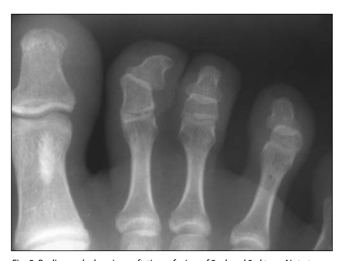
Fig. 5. Radiograph showing soft-tissue fusion of 2nd and 3rd toes. Note too bone island on the big toe.

Radiography of the feet revealed soft-tissue syndactyly of the 2nd and 3rd toes bilaterally and a bone island on the proximal phalanx of the big toe (Fig. 5). Based on these clinical and radiological findings, a diagnosis of Gorlin syndrome was made. No evidence of calcification of falx cerebri was detected during the CT scan. Surgical excisions of the cysts were performed under general anaesthesia. Histopathological examination of the excised specimens revealed features of odontogenic keratocyst. The patient did not agree to surgical correction of the finger and toe deformities. Unfortunately, he could be followed up for only 6 months, during which time no relapse was observed.