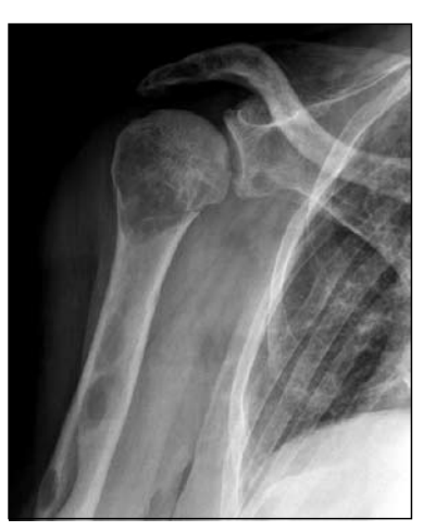
Fig. 2. Antero-posterior view of the right shoulder.