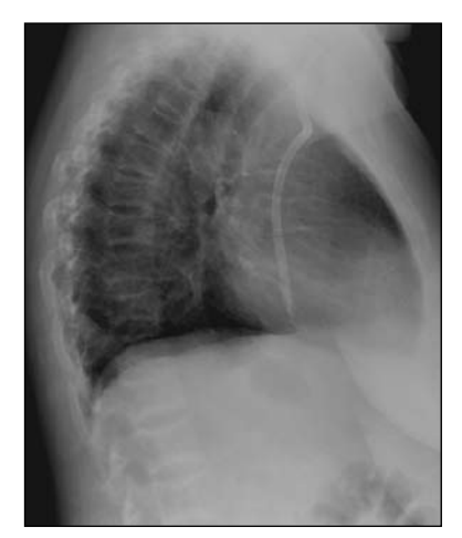
Fig. 1. Lateral chest radiograph.

A chronically ill 49-year-old woman presented to the trauma unit with acute on chronic right arm pain after a syncopal episode. The following radiographic images were obtained (Figs 1 - 3).