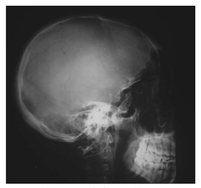
Fig. 1a. Lateral skull radiograph. Teflon felt is not visible

No abnormality was visible on plain film radiographs of the skull (Fig. 1a). A CT scan of the brain, however, demonstrated a large, folded, radio-dense foreign body within the soft tissues of the scalp in the left tempero-parietal region (Fig. 1b). At surgical exploration under general anaesthetic, two felt-like foreign bodies were removed with difficulty from ingrowing tissue. These were subsequently identified as Teflon felt.