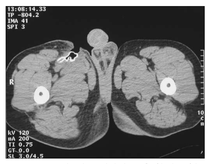
Fig. 2c. CT scan image through upper thighs shows Teflon felt in base of ulcer. Ulcer crater contains air; this accounts for the fine linear lucencies visible within the soft tissues of the right medial thigh on the pelvic radiograph.

A radiograph of the pelvis including the upper thighs was obtained. This showed faint linear lucencies within the soft tissues of the medial thigh on the right (Fig. 2b). No radio-dense foreign body was visible. A CT scan of the right inguinal region and thigh was then performed and this showed a folded, radio-dense foreign body, extending over a long segment of the upper thigh (Fig. 2c). At surgical exploration under general anaesthetic, a 6 x 4 cm piece of Teflon felt intimately associated with the old femoral artery repair was removed and the wound closed. The patient subsequently made a full recovery and returned to work.