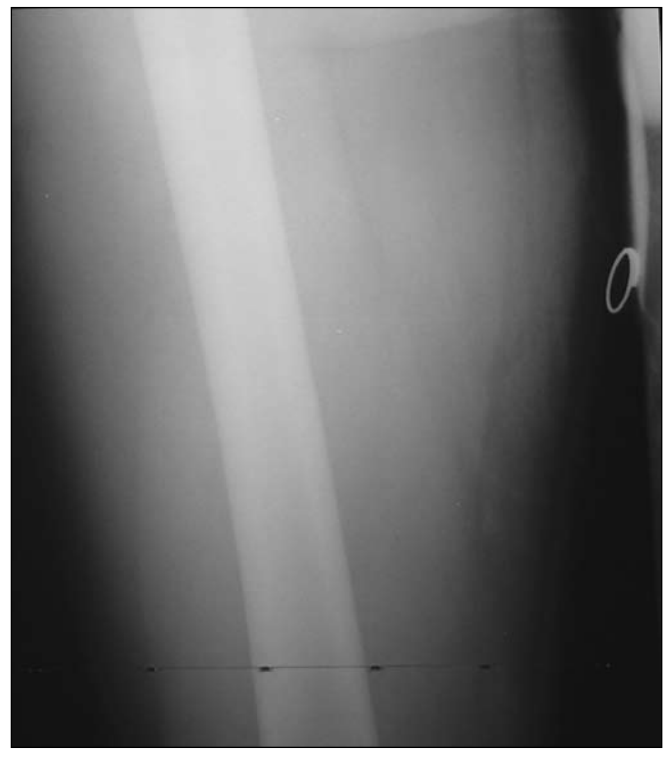
Fig. 2a. Right thigh with circular metallic skin-marker; Teflon felt not visible.