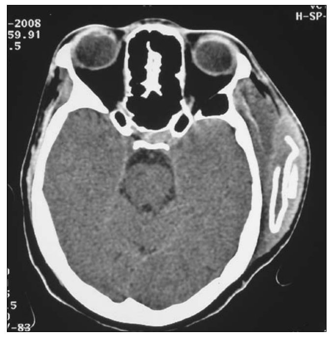
Fig. 1b. CT image showing Teflon felt in soft tissues of scalp.