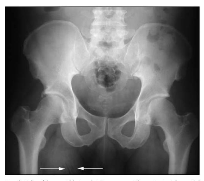
Fig. 2b. Teflon felt not visible in pelvic X-ray; note air lucencies in right medial thigh (arrows).

dressings. He was re-admitted in January 2010 with recurrence of the wound sepsis, with skin ulceration and a discharging sinus.