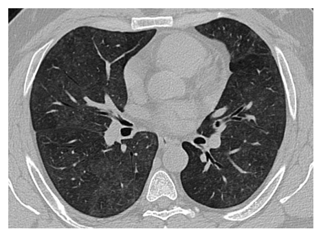
Fig. 5. Axial HRCT at aortic root level.