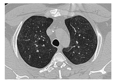
Fig. 3. Axial HRCT at aortic arch level.