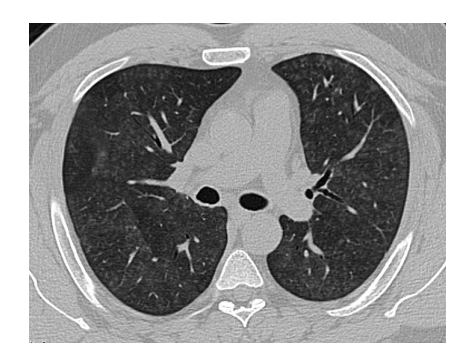
Fig. 4. Axial HRCT at pulmonary artery level.