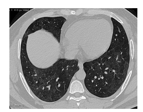
Fig. 6. Axial HRCT at diaphragm level.