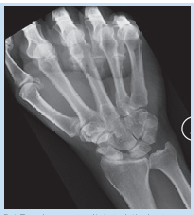
Fig. 2. The gap is more pronounced in the clenched hand-position.

SLI is diagnosed with a gap or separation between the scaphoid and the lunate bones on a posterior anterior wrist X-ray. More than 2 mm is suspicious and 4 mm or more is diagnostic of SLI.<sup>1,2</sup> This scaphoid-lunate gap is also referred to as the 'Terry Thomas' sign (Fig. 1) referring to the distinctive gap between the upper incisors of the late British comedian.