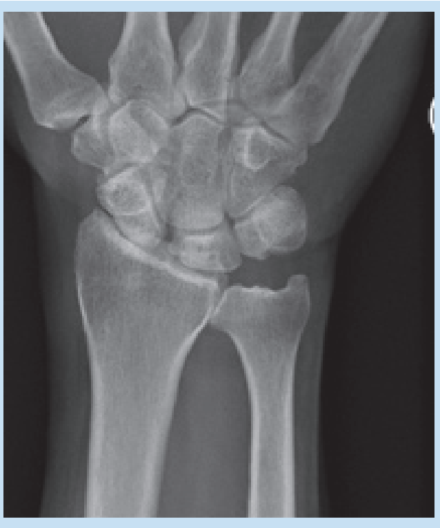
Fig. 1. Posterior anterior wrist X-ray demonstrating the widened gap between the scaphoid and the lunate bone 'Terry Thomas' sign. There is in addition foreshortening of the scaphoid with a 'ring sign'. Underlying osteodegenerative changes are noted; these and the radio carpal joints are due to longstanding SLI.

Scapholunate instability (SLI) (also known as scapholunate dissociation or rotary subluxation of the scaphoid) is caused by a tear in the inter-osseous ligaments of the lunate, scaphoid and the capitate bone with a tear in the dorsal radiocarpal ligaments by acute dorsifexion injury or fractures of the distal radius. <sup>1,2</sup> The patient complains of wrist pain, weakness of grip and a clicking sensation in the wrist.