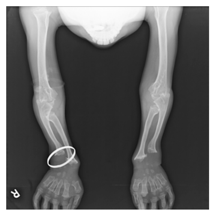
Fig. 3. X-ray of hands and wrists in AP view showng metaphyseal expansion of long bones with cortical thinning, conical (bullet-shaped) proximal bases of 2 - 5 metacarpals with normal construction of metacarpal shafts and tapering of the proximal phalanges. The ossified carpal bones are small and reduced in number for the patient's age. The planes of both the distal ulnar and radial growth plates are slanted towards each other.

A genetic defect has been identified in the N-acetyl-galactosamine-6sulphate sulphatase (GALNS gene) in Morquio's syndrome type IVA or