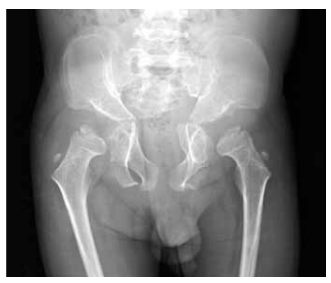
Fig. 4. X-ray of the pelvis and both femurs in AP view shows flared iliac bones laterally with inferior constriction (wine-glass shape). Enlargement of both acetabular cavities is seen with rough margins, and poorly formed femoral epiphyses and widened femoral necks with coxa valga.

beta-galactosidase (GLB1 gene) in Morquio's syndrome type IVB. The catabolism of chondroitin 6-sulphate is also affected by the GALNS gene defect.<sup>3</sup> The metabolism of heparan and dermatan sulphate is normal in Morquio syndrome, which is why patients with Morquio syndrome do not have mental retardation. Patients with Morquio's syndrome appear healthy at birth. Marked dwarfism, abnormal curvature of the spine (kyphoscoliosis), and decreased tone and weakness are prominent early childhood presentations. Also seen are coarse facies, short nose,