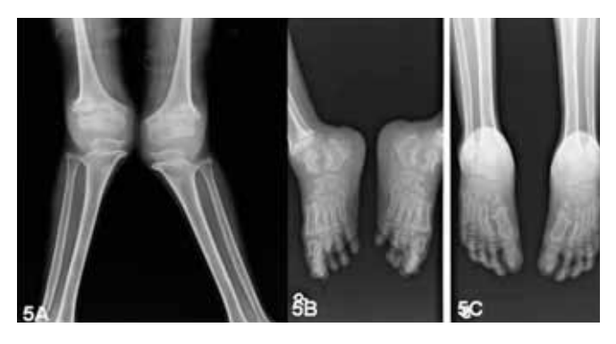
Fig. 5. X-ray of both knees in AP view (5A) and leg with foot in AP (5B) and lateral view (5C) showing genu valgus, metaphyseal expansion of long bones, and tapering of the proximal phalanges respectively.

broad mouth, and widely spaced teeth with thinned enamel. The patient may have a waddling gait. Pectus carinatum (horizontal and protuberant sternum) and a shortened neck with clouding of the cornea, ligamentous laxity and joint stiffness are also seen. Mental capacity is generally unimpaired.