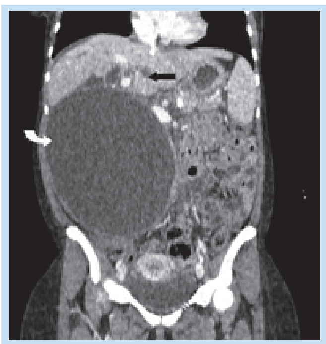
Fig. 1. Coronal reconstruction of multislice CT abdomen demonstrates a massive cystic lesion (curved arrow) at the right inferior border of the liver, choledochal cyst, with associated intrahepatic biliary dilatation (black arrow)

On surgical exploration a large bile-containing cyst was found, arising from the proximal aspect of the common bile duct, compatable with a type I choledochal cyst. Complete excision of the cyst was performed and a choledochoduodenostomy was done.