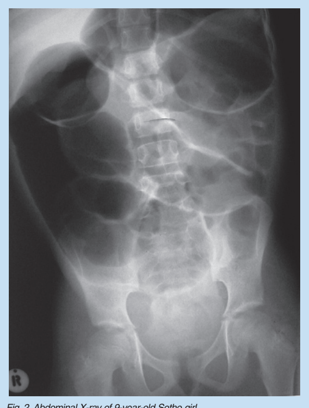
Fig. 2. Abdominal X-ray of 9-year-old Sotho girl.