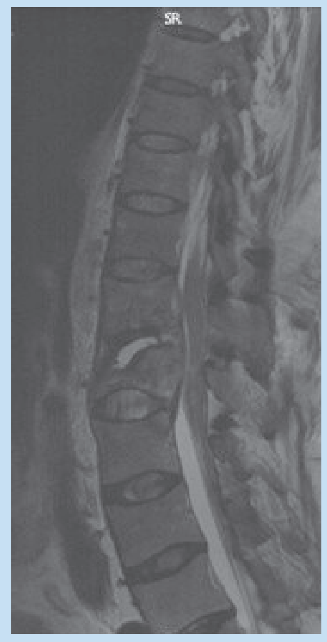
Fig 5. T2 sagittal image. Elevated, but intact posterior longitudinal ligament.