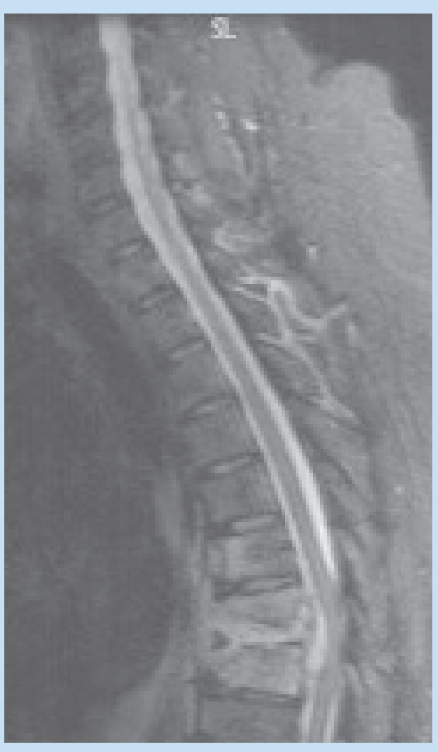
Fig 3c. Sagittal STIR image. High signal in affected vertebrae.