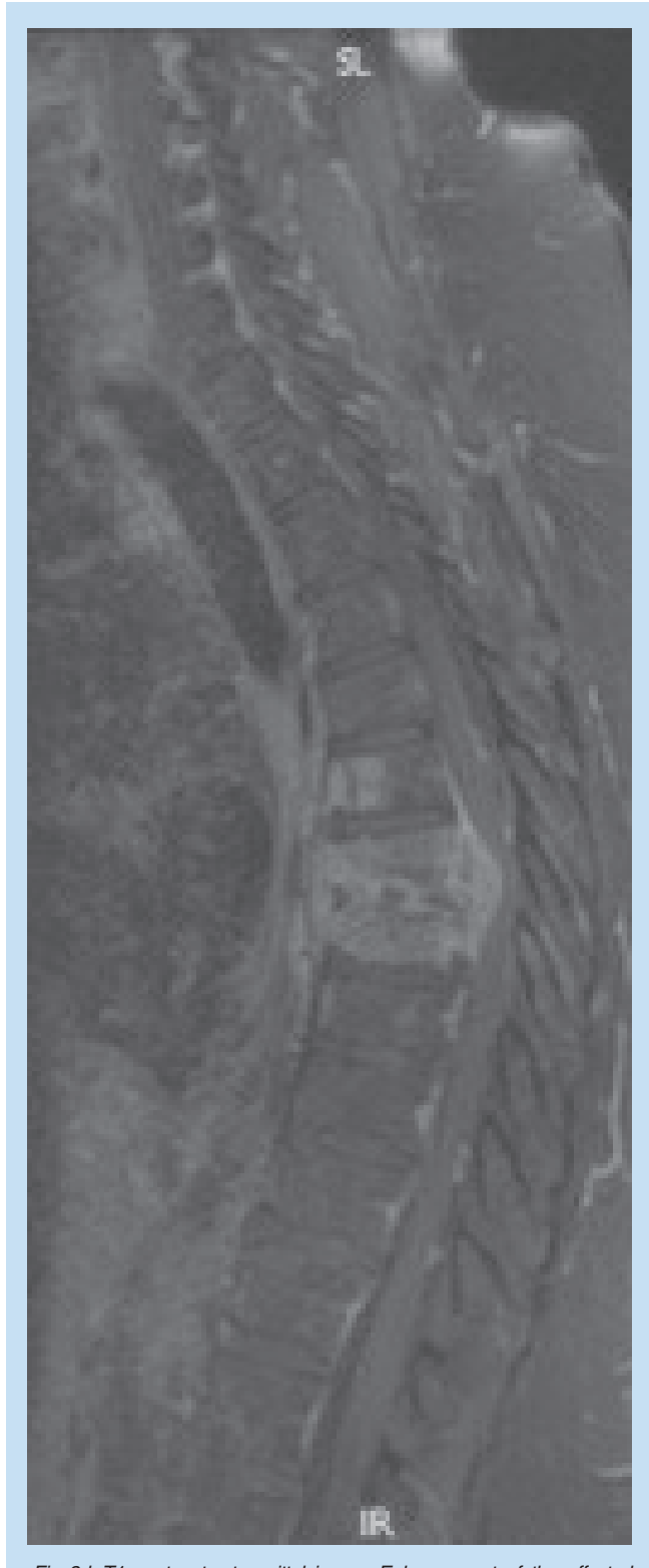
Fig 3d. T1 postcontrast sagittal image. Enhancement of the affected vertebrae.