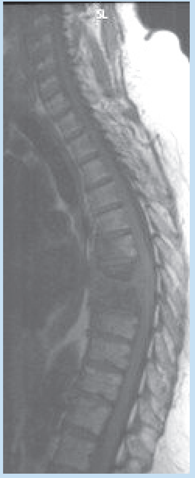
Fig 3a. T1 sagittal image. Low signal in affected thoracic vertebrae.

Fig. 5 shows elevation with an intact posterior longitudinal ligament.