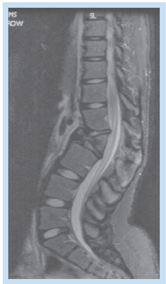
Fig 2. T2 sagittal image. Predominantly anterior vertebral body destruction of L2, with gibbus formation.

seen in 13%(3 of 23) of affected vertebrae (Fig. 4).