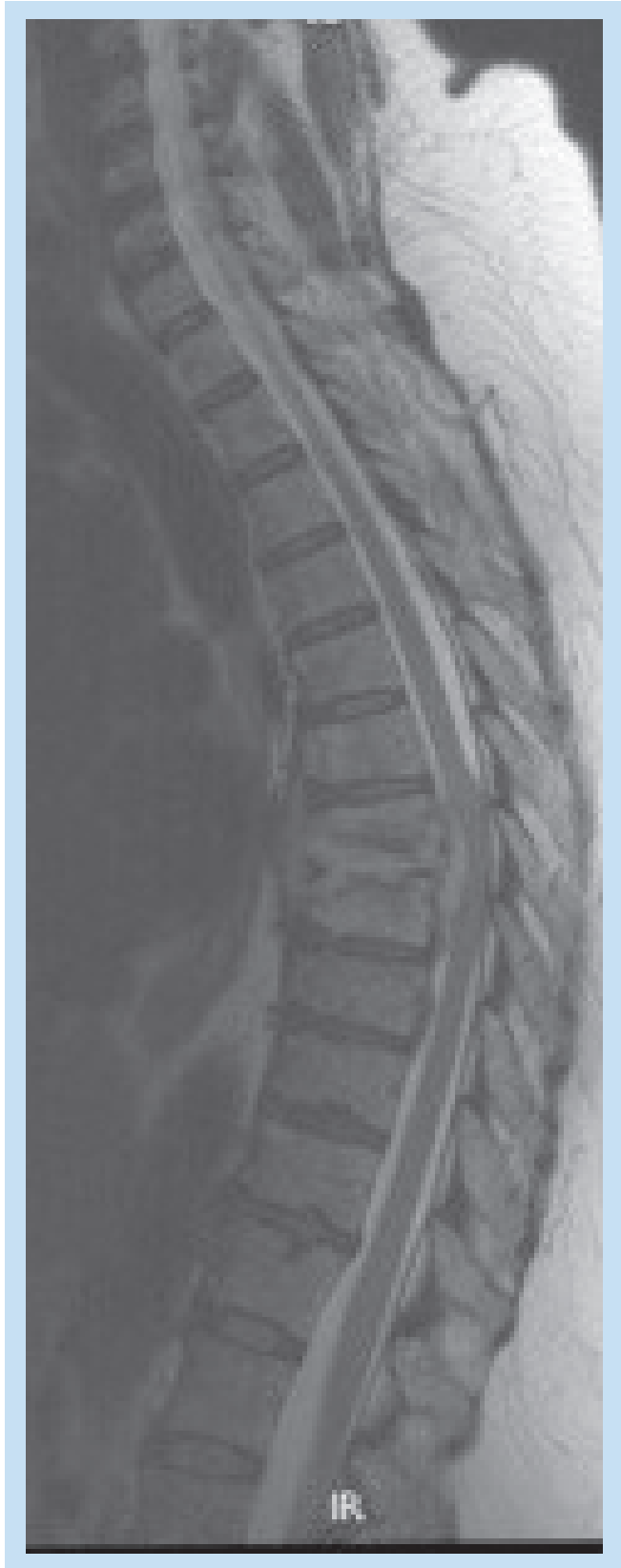
Fig 3b. T2 sagittal image. High signal in affected vertebrae.