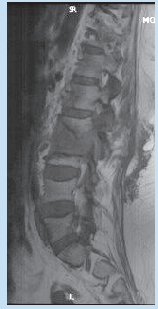
Fig 1. T1 sagittal image. Partial destruction of the anterior and posterior vertebral bodies of L2 and L3.

All patients, with the exception of one who had no disc involvement, had varying degrees of complete and partial disc destruction at different levels.