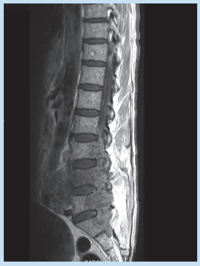
{\it Fig.~3.~T1~post~gadolinium.~Mode rate~inhomogeneous~enhancement~of~the~soft~tissues.}