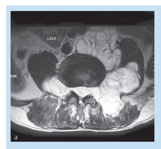
Figs 2a and b. T2 axial (a) and coronal (b). Lobulated hyperintense mass infiltrating spinal canal as well as paravertebral muscles.