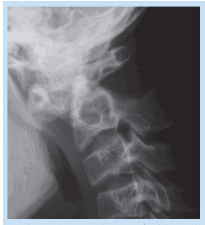
Fig. 3. Flexion view demonstrating a decrease in spinal canal diameter with flexion while the ADI increases in dimensions