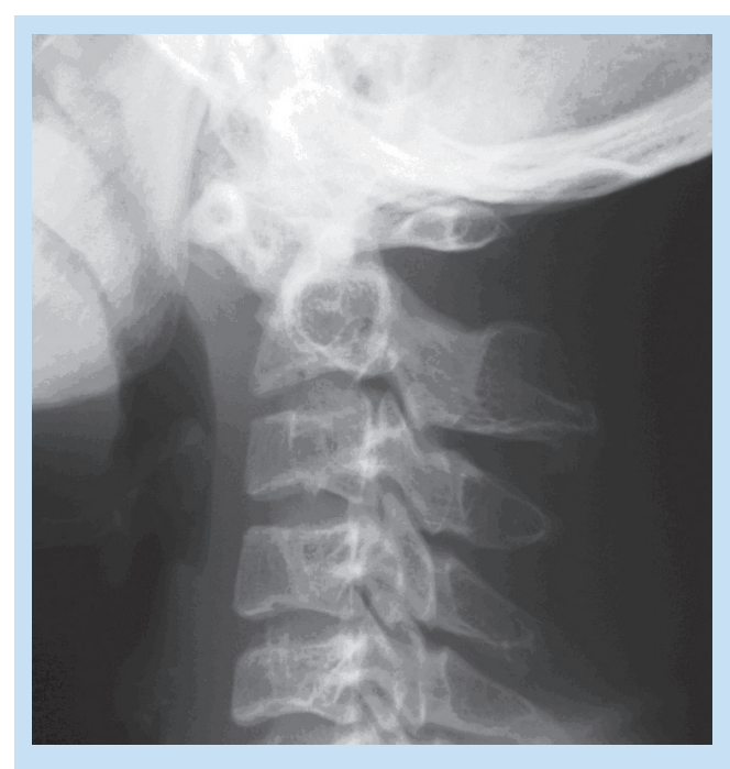
Fig. 1. Lateral neck view demonstrating an atlantodental interval (ADI) of 11 mm compared to the normal for adult males of up to 3 mm. Well-corticated bony ossicles are visualised superior and inferior to the anterior arch. The dens is small and the posterior arch of C1 is displaced anteriorly. The spinal canal is reduced in diameter.

A 22-year-old man sustained an injury to his neck when he was pushed into the back of a pick-up truck. He reports that when his head hit a metal plate in the truck, he felt dizzy followed by a sensation of pins and needles in his arms and legs. He was subsequently unable to move his arms and legs at all. His childhood had been uneventful, and he had worked as a bricklayer's assistant.