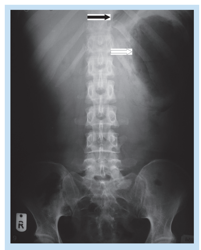
Fig. 2. Abdominal X-Ray, showing the displaced stomach bubble (black arrow). Laterally, a large ovoid gas shadow is seen (white arrow).

stomach was medially displaced (Fig. 4). There was no evidence of free air within the peritoneal cavity.