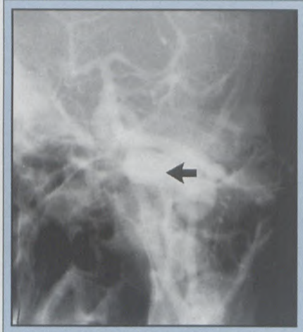
Figure 3: Selective left vertebral angiogram confirms the tortuous left hypoglossal arterial anastomosis (arrow).

The cerebral vasomotor response was tested with intravenous Diamox without any further abnormalities noted on the SPECT scan. Transcranial Doppler sonography including dynamic studies with head rotation and flexion was normal. Specifically basilar artery velocity was unchanged with head rotation to the right and left for 2 minutes each. She was treated