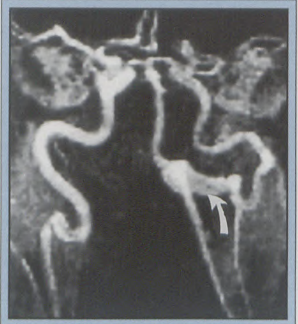
Figure 2: MR angiogram demonstrates the tortuous left hypoglossal artery (arrow). Note the aplastic right vertebral artery (arrowhead).

left hemisphere hypoperfusion to visual inspection and semiquantitative analysis (Figure 4). The asymmetry index was calculated as 22%, significantly different to the normal controls (n=5) with a mean value of 4.2% for the parieto-occipital region (standard deviation \pm 2.7, range 0 - 9.5).