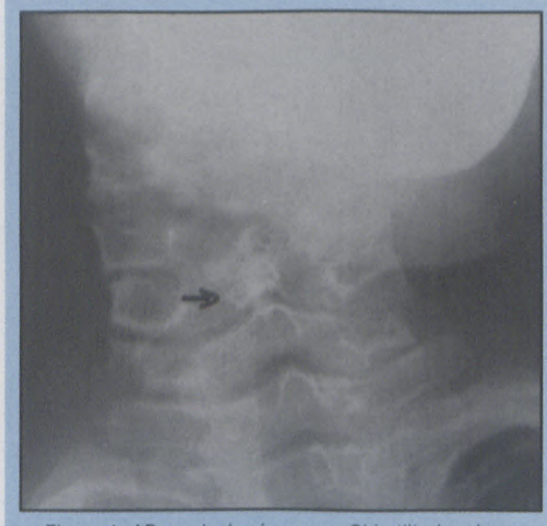
Figure 1: AP cervical spine x-ray. Chin tilted and rotated to the left. Scoliosis convex to the right. Dense, oval shaped, central calcified intervertebral disc (arrow) at C5/6 level.

Plain x-rays of the cervical spine were performed at the time of the initial consultation. The anteroposterior (AP) (Figure 1) and lateral (Figure 2)