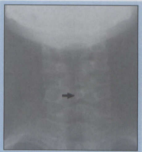
Figure 4: AP cervical spine follow-up x-ray. Normal alignment. Two, small, poorly visible calcifications (arrow) in the C5/6 intervertebral disc immediately to the right of the C5 spinous process.