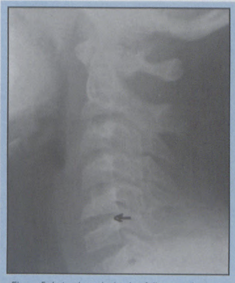
Figure 5: Lateral cervical spine follow-up view. Normal alignment. Multiple, poorly visible, small calcifications (arrow) scattered in the C5/6 intervertebral disc. Anterior wedging of the C5 vertebral body still present.

the C5/C6 intervertebral disc was less easily visible, with multiple, small, poorly seen residual calcifications evident. The anterior wedging of the vertebral body of C5 was unchanged after three and a half months. The patient was considered to have been adequately treated, and was discharged from further follow-up.