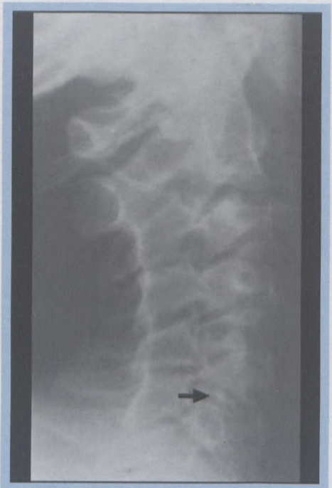
Figure 2: Lateral cervical spine x-ray. The slight rotation and scoliosis results in poor lateral positioning. Linear, layered, densely calcified C5/6 intervertebral disc (arrow). Anterior wedging of the C5 vertebral body also present.

projections demonstrated scoliosis convex to the right, with tilting and rotation of the head towards the left, plus dense, irregular, layered calcification of the intervertebral disc at the C5/C6 level. Loss of height of the anterior C5 vertebral body was present, giving it a wedge shape. The paravertebral soft tissues plus the remainder of the cervical vertebral bodies and their