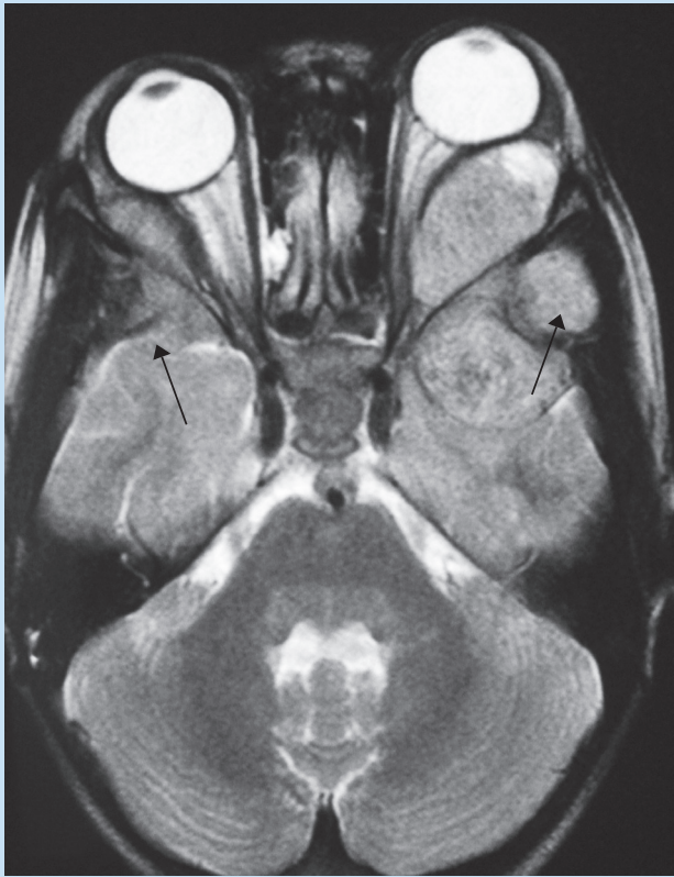
Fig. 2. T2 axial MRI image showing retrobulbar metastases originating in the sphenoid bone.

4 of the cases. The most common cause was orbital cellulitis, followed by thyroid eye disease and optic nerve/chiasm glioma. 3