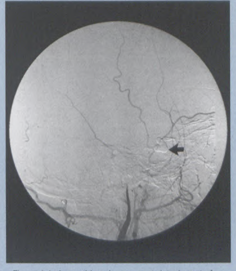
Figure 4: Left carotid angiogram post detachment of the balloon and post detachment of a second balloon

used to perform the trial occlusion test. Only if it seems unlikely that the patient will pass the trial occlusion test, or if a permanent occlusion is not planned, is a non-detachable balloon used. The detachable balloon is filled with isoosmolar solution of contrast and sterile water. It is inflated and checked for a