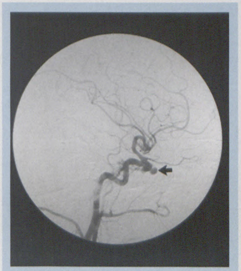
Figure 1: Left internal carotid angiogram. Pseudoaneurysm with CCF arising from the carotid syphon

Various other tests have been used in combination with clinical testing during trial occlusion. Stump pressure is not an accurate predictor of stroke risk.<sup>2</sup> Angiographic evidence of cross filling via collaterals is a poor indicator of whether the patient will tolerate permanent occlusion. The venous phases of an angiogram are a better predictor of tolerance to permanent occlusion.<sup>3</sup> If there is less than a 1.5 second delay in the appearance of the venous phase, following an injection