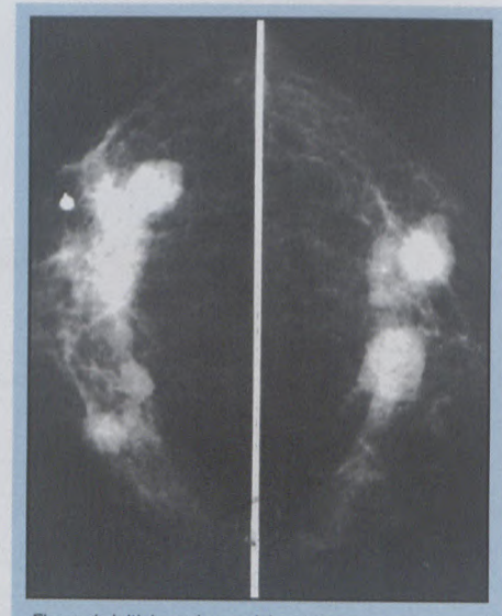
Figure 1: Initial cranio caudal mammogram demonstrates bilateral breast cysts.

A 52 year-old woman was referred for a mammogram because of a palpable mass in the outer quadrant of the right breast. Mammography (Figure 1) demonstrated multiple, well defined masses bilaterally. There was no microcalcification or spicultation. Ultrasound confirmed that these were simple cysts. Cyst puncture was not