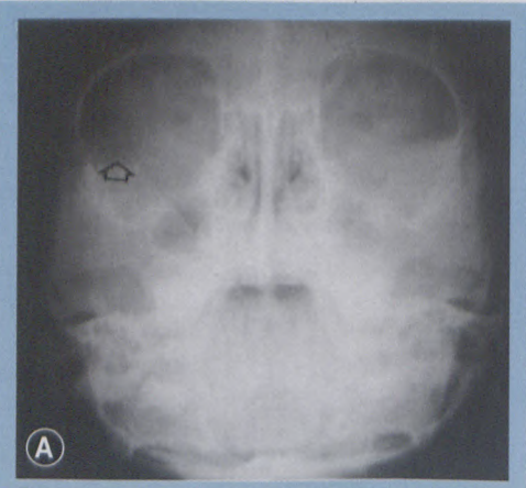
Figure 1a: Lucency involving the lateral right orbit with lytic destruction (open arrow) of the right greater wing of sphenoid.

A three-and-a-half year-old boy presented with a two-month history of a slowly increasing swelling over the right frontoparietal region of the skull. There were no constitutional symptoms of TB or TB contacts. The swelling was non-tender and was not fluctuant. A skull X-ray (Figure 1a) and a subsequent CT brain (Figures 1b and c) were performed. The diagnostic differential at this stage included