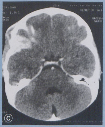
Figure 1c: Axial post-contrast CT of the head shows soft tissue swelling in the right frontoparietal region with contrast enhancing soft tissue on both sides of the calvarium and in the region of the right anterior temporal lobe.