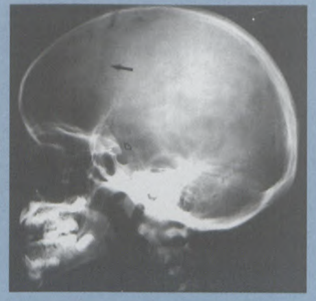
Figure 2: This six-year-old boy shows normal convolutional markings during the period of rapid brain growth. Note that the sutures (arrow) are visible and normal and that there are no changes involving the sella turcica (open arrow).

Hammer/copper/silver/ pewter-beaten skull