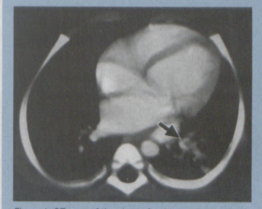
Figure 1: CT scan of the chest after intravenous contrast administration demonstrates a brightly enhancing conglomerate of vessels (arrow)

An eight-month-old male patient with Down's syndrome was referred for cardiac catheterisation at the Red Cross Children's Hospital. He had signs of a left-to-right shunt with bounding pulses and a machinery murmur at the upper left sternal border. Both on clinical grounds and on echocardiographic examination it was felt that he had a PDA. Cardiac catheterisation (with a view to possible coil embolisation) was performed. At catheterisation, a duct was seen but was noted to be small. The larger feeding vessel was noted during the same angiogram. A contrast CT scan confirmed that there was a pulmonary arteriovenous malformation occupying the lower lobe of the left lung (Figures 1, 2 and 3). An artery originating from