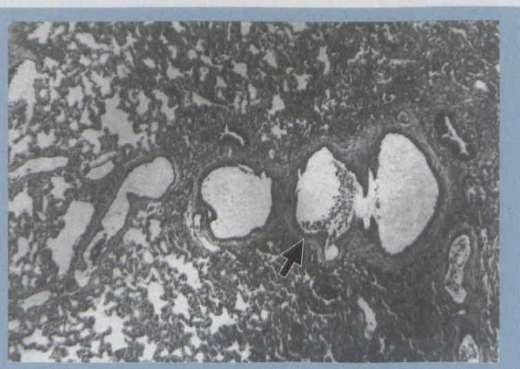
Figure 4: Pulmonary AVM – an interconnected arrangement of thick-walled vascular channels (arrow) within the lung parenchyma ( H\&E \times 4 )

PAVM usually occurs in the lower lobes and is solitary in 75% of cases.<sup>8</sup> It can be classified as either simple or