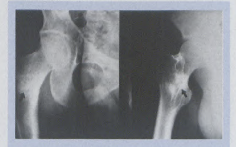
Figs 4 and 5. Right hip X-rays 10 days after the Comrades Marathon showing ill-defined sclerosis in the intertrochanteric region (arrows).

The patient was treated conservatively. He presented 10 days later complaining of unremitting pain in the right hip. He had been for two short 'leg stretching' runs in the interim. Repeat X-rays of the right hip (Figs 4 and 5) demonstrated an obvious illdefined area of sclerosis traversing the right femoral intertrochanteric region — consistent with a stress fracture. No clearly defined lucent fracture line was noted.