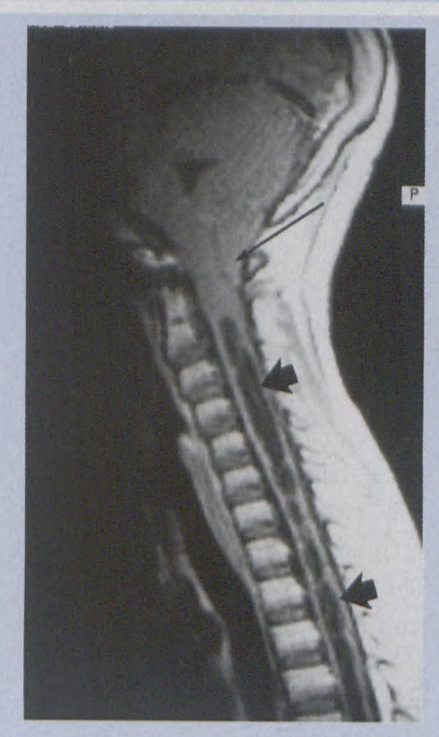
Fig. 3. Chiari type I malfomation. Sagittal T1 weighted MRI image shows the tonsillar ectopia (long arrow). Associated syringohydromyelia (short arrows) can be found in 20 - 25% of these patients.

years tonsillar ectopia is only pathological when there is more than 6 mm projecting through the foramen magnum.