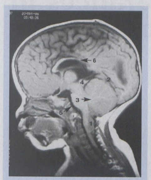
Fig. 1. Chiari type II malformation. Sagittal T1 weighted MRI image shows the small posterior fossa, tonsillar vermian herniation through foramen magnum (1), low-lying venous confluence with a steep (vertically orientated) straight sinus (2), low-lying 4th ventricle with a narrow AP diameter (3), tectal (quadrigeminal plate) beaking (4), scalloped clivus (5) and corpus callosum hypogenesis (6). Many of the supratentorial features (not shown here) are best seen on axial images.

This is also known as the Arnold-Chiari malformation. Once a myelomeningocoele has been closed surgically after birth, most patients develop hydrocephalus. This is the commonest indication radiological evaluation at which time the features of Chiari type II will be visualised. This anomaly is formed when the posterior neuropore fails to close resulting in failure of the ventricles to expand and so create a normal size posterior fossa with subsequent failing in separation of the thalami.1 Intra-uterine surgical closure of the myelomeningocoele (http://www.fetalsurgery.com) prevents development of this malformation. The imaging features result from