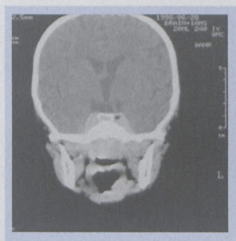
Fig. 3. Coronal of brain with air in cavernous sinus.

A syndrome characterised by the triad of suppurative otitis media, trigeminal nerve pain in the first divi-