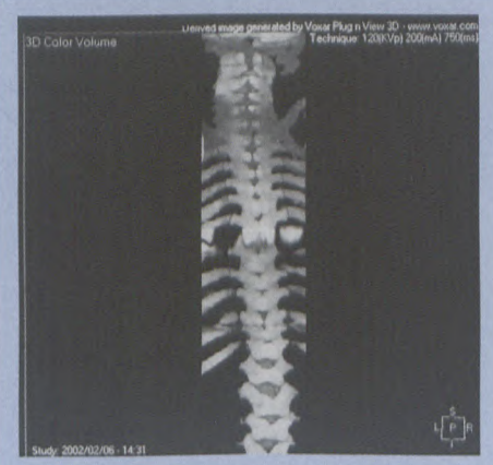
Fig. 3. CAT scan reconstruction of the spine demonstrating the spina bifida in the cervical and thoracic region.

A CT scan of the brain was not performed.