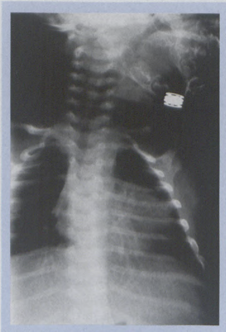
Fig. 1 AP spinal X-ray of the cervical and thoracic spine showing the extensive spina bifida involving both regions.

The defects were more pronounced in the upper cervical and sacral areas. The spinous processes in the thoracic and lumbar areas were visualised though they were not fused. A CT scan reconstruction of the