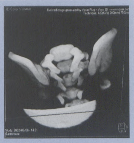
Fig. 4. CAT scan reconstruction of the sacrum demonstrating the open spinal canal in this region.

Simple occult spinal dysraphism is often an incidental finding caused by an incomplete closure of the spinal arches of the posterior elements of the vertebrae.