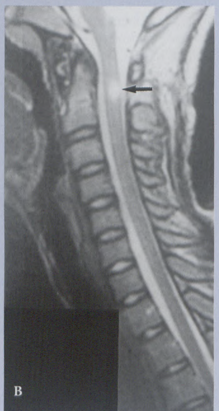
Fig. 4a, b. MR T1 and T2 sagittal scans of a patient with quadraparesis following a stab injury 5 weeks previously demonstrates focal myelomalacia at the C2 level (arrows).