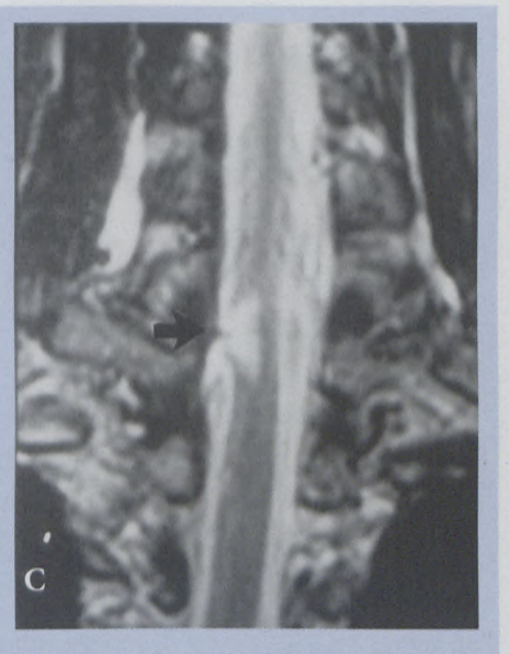
Fig. 1a, b, c. T1 and T2 sagittal and coronal MR scans of a patient (2047/98) who presented with Brown-Séquard syndrome demonstrating partial cord transection at the cervicothoracic junction following a knife wound (arrows).

and contralateral sensory loss to pain and temperature below the level of injury. On MR imaging these patients may have evidence of a partial transection of the spinal cord in an oblique or parasagittal plane or focal cord contusion. It is important to realise that Brown-Séquard syndrome may also be due to focal cord contusion which often resolves, while patients with partial cord transection do not usually recover function. This has been detected in patients with Brown Séquard syndrome following blunt cervical trauma.<sup>4</sup>