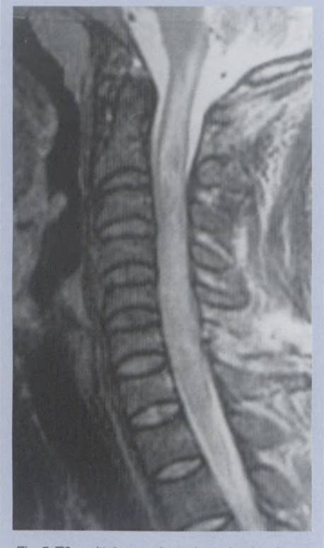
Fig. 5. T2 sagittal scan of a patient who developed quadraparesis following a penetrating gun shot wound to the cervical spine demonstrates extensive spinal cord contusion.

these patients sustained a contrecoup contusion of the cord as the cord was compressed against the bony canal by the knife blade. In Peacock and coworkers' series of 450 spinal cord stab injuries, of which one-half were the Brown Séquard syndrome, they found that two-thirds of patients made a functional recovery.5 This study was performed before MR was available and it is likely that many patients actually had spinal cord contusions rather than partial transections. The presence of extramedullary haematoma was uncommon in our series and did not appear to influence the outcome. Vertebral artery occlusion was established in one patient on MR angiography and selective vertebral angiography and postulated in the patient with vertebrobasilar infarction. It is likely that vertebral artery injury remains undetected in these patients unless