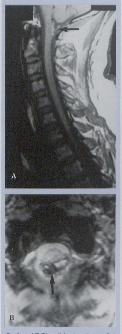
Fig. 3a, b. MR T1 sagittal and gradient recalled axial of a patient with quadraparesis following a C1 knife injury demonstrates posterior intra and extradural haematoma and cord contusion (arrows).