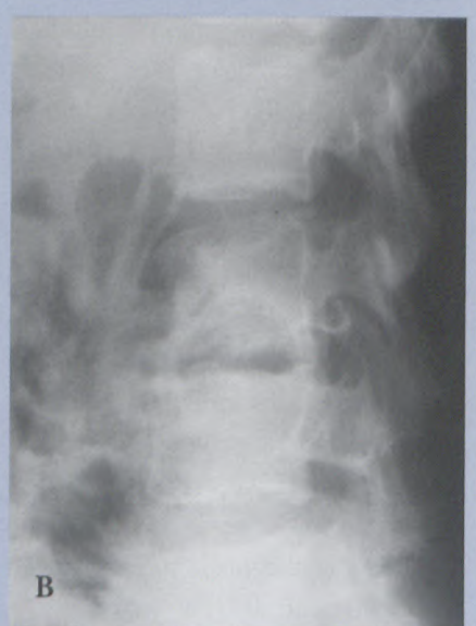
Fig. 1a, b. AP and lateral views of the lumbar spine showing destruction of the vertebral body of L3 with narrowing of the L3-4 disk space due to spinal tuberculosis.