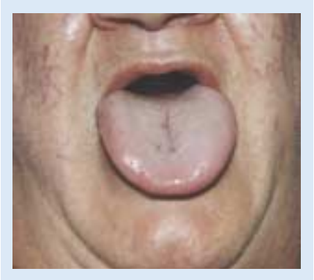
Fig. 4a. Mucocutaneous telangiectasias on the tongue of a patient with hereditary hemorrhagic telangiectasia (HHT).

quently covering the entire face, neck, trunk and extremities. Overgrowth of facial soft-tissues and facial bones may occur under the area of the port-wine stain, although this overgrowth is rarely seen in black patients.14 Other variations include the occurrence of facial skin lesions with ocular anomalies but without the intracranial abnormalities, or where the leptomeningeal angiomatosis occurs without the port-wine stain.47,48 Portwine stains may also be found in association with a number of other congenital syndromes including Cobb syndrome (spinal metameric arteriovenous malformation), Wyburn-