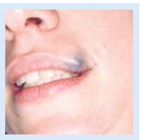
Fig. 3a. Small venous malformation of an upper lip. Note the characteristic bluish colouration.

Venous malformations (VMs), often incorrectly termed cavernous haemangiomas, are low-pressure, low-flow malformations. They are present at birth, although not always visible at that stage, and undergo slow growth commensurate with the growth of the child.<sup>1,27</sup> VMs are soft, compressible, non-pulsatile masses that expand after a Valsalva's manoeuvre or in a dependent position. They have a bluish colour often with normal overlying skin (Figs 3a, b). Forty per cent are found in the head and neck region, 20% on the trunk and 40% on the extremities. VMs can be superficial (cutaneous) or occur in