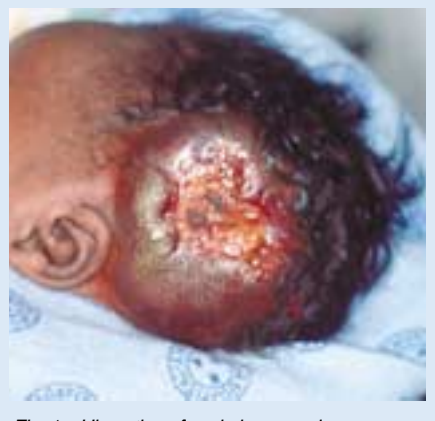
Fig. 1c. Ulceration of scalp haemangioma.

haemangiomas) would include:<sup>27,28</sup> ( i ) periocular lesions threatening vision; ( ii ) lesions obstructing the airway; ( iii ) large lesions associated with high-output cardiac failure; ( iv ) facial lesions with rapid growth and distortion; ( v ) lesions with severe persistent cutaneous ulceration or haemorrhage (Fig. 1c); and ( vi ) Kasabach-Merritt syndrome.