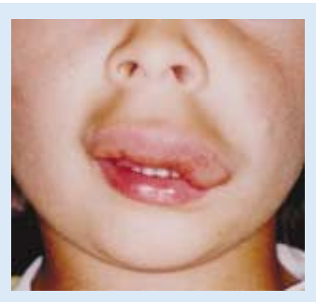
Fig. 5b. Lymphatic malformation of the upper lip.

LMs may be associated with a number of syndromes including Turner's syndrome, Noonan's syndrome, multiple pterygium syndrome, fetal alcohol syndrome, Klinefelter's syndrome, Down's syndrome, and Klippel-Trenaunay and Parkes-Weber syndromes.<sup>33,53</sup>