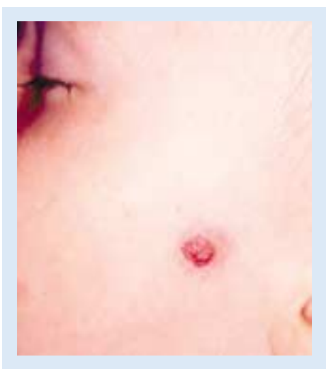
Fig. 1a. Small cutaneous haemangioma on the cheek of an infant.

to 40% of lesions are apparent at birth, with 70 - 90% appearing during the first 4 weeks of life and none beyond the age of 5 years. Haemangiomas may be superficial (cutaneous), deep (covered by normal overlying skin) or visceral.<sup>22</sup> They can occur in any race, but are more common in girls (3:1), light-skinned whites and premature infants (20%) especially those with a birth weight < 1500 g.<sup>23</sup> The superficial cutaneous lesions tend to show a bright red colour initially that deepens during the first year of life (Fig. 1a).