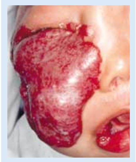
Fig. 1b. Large maxillary and periorbital cutaneous haemangioma. Its anatomical position threatens the function of the eye.

Most haemangiomas are recognised clinically. Imaging is only required in cases where there is diagnostic uncertainty or where intervention is required. Ultrasound (with doppler) will rapidly distinguish solid haemangiomas from vascular malformations. Computed tomography (CT) and magnetic resonance imaging (MRI) will help to assess the depth and extent of lesions. Angiography, while showing a characteristic homogeneous contrast blush without evidence of AV shunting, should rather be reserved for therapeutic purposes.<sup>27</sup> In most cases no treatment is required because of spontaneous regression. However 10 - 20% of lesions will require treatment because of impending (or established) loss of function or a threat to life (Fig. 1b). Treatment for cosmetic reasons alone is a controversial indication given the natural history of these lesions. More often than not the parents are more affected by appearance than the children themselves except as the children approach school age. Examples of indications for active treatment (i.e. 'alarming'