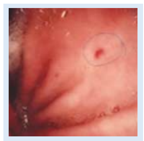
Fig. 4b. Mucosal telangiectasias seen in the duodenum at endoscopy.