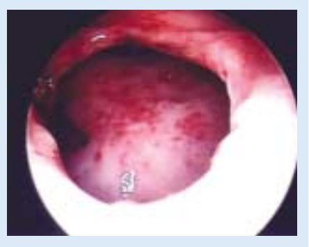
Fig. 4d. Nasal endoscopic view showing multiple nasal telangiectasias seen through a septal perforation that has resulted from repeated surgical procedures for intractable epistaxis.

Mason syndrome (CAMS 2), Von Hippel-Lindau disease, Proteus syndrome, Roberts's syndrome and thranbocytopenia-absent radius (TAR) syndrome.<sup>36</sup> Treatment of the port-wine stains includes dermabrasion, tattooing, laser and surgery.