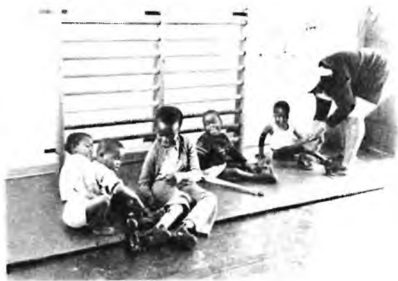
Handicapped children preparing for their classes.