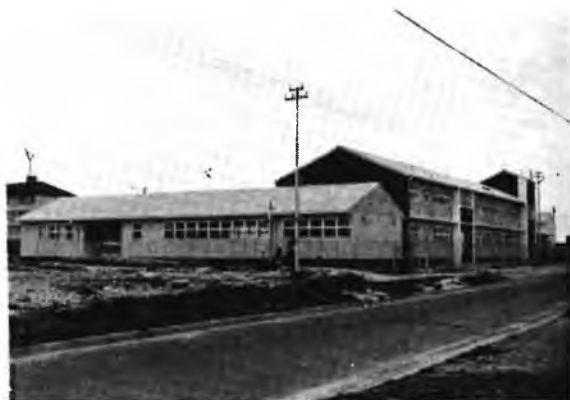
Dr. Abduruman Day Hospital, opened in Athlone on 2.10.72.