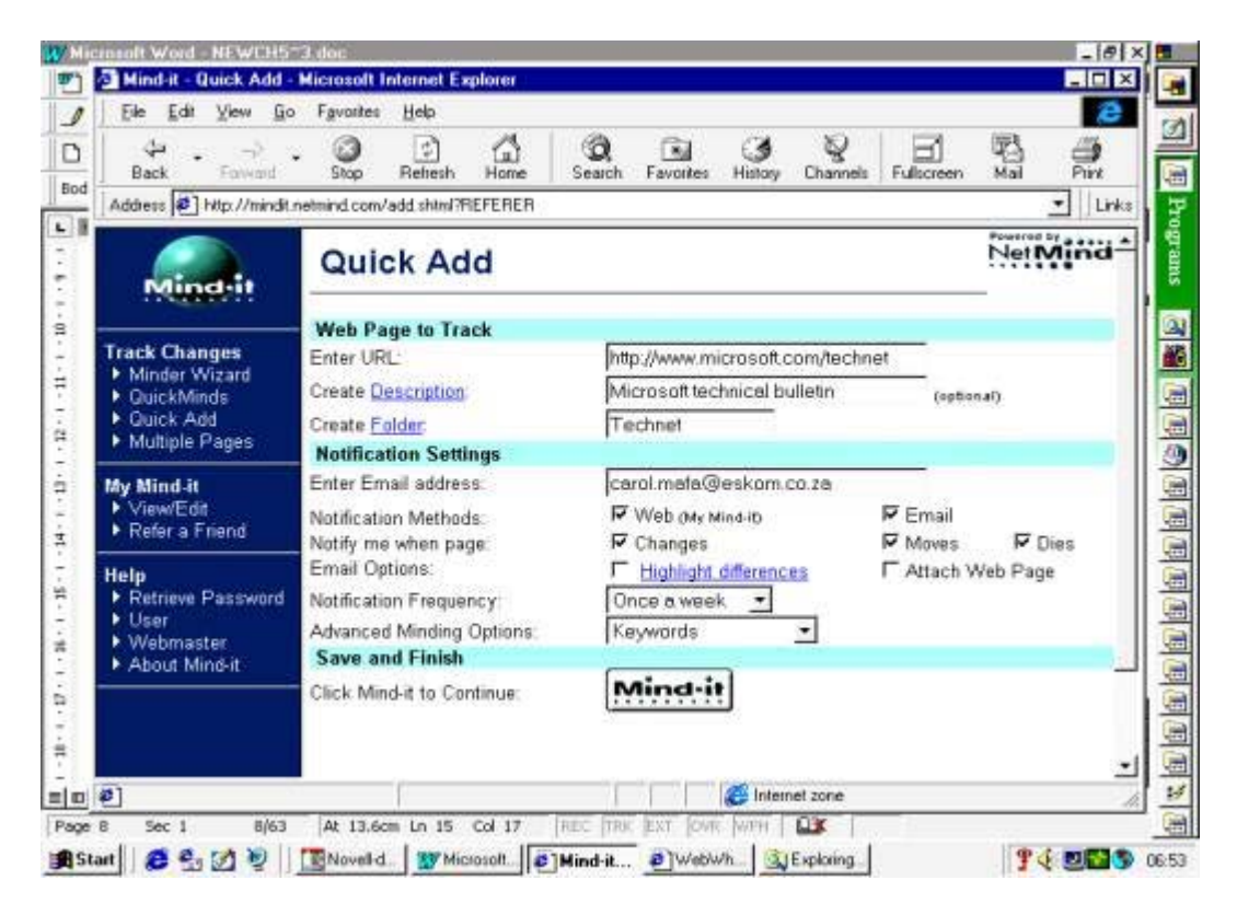
Figure 2 Mind-It tracking system

After submitting the sign-on page, a new subscriber receives an e-mail message that confirms registration with the Mind-It service.