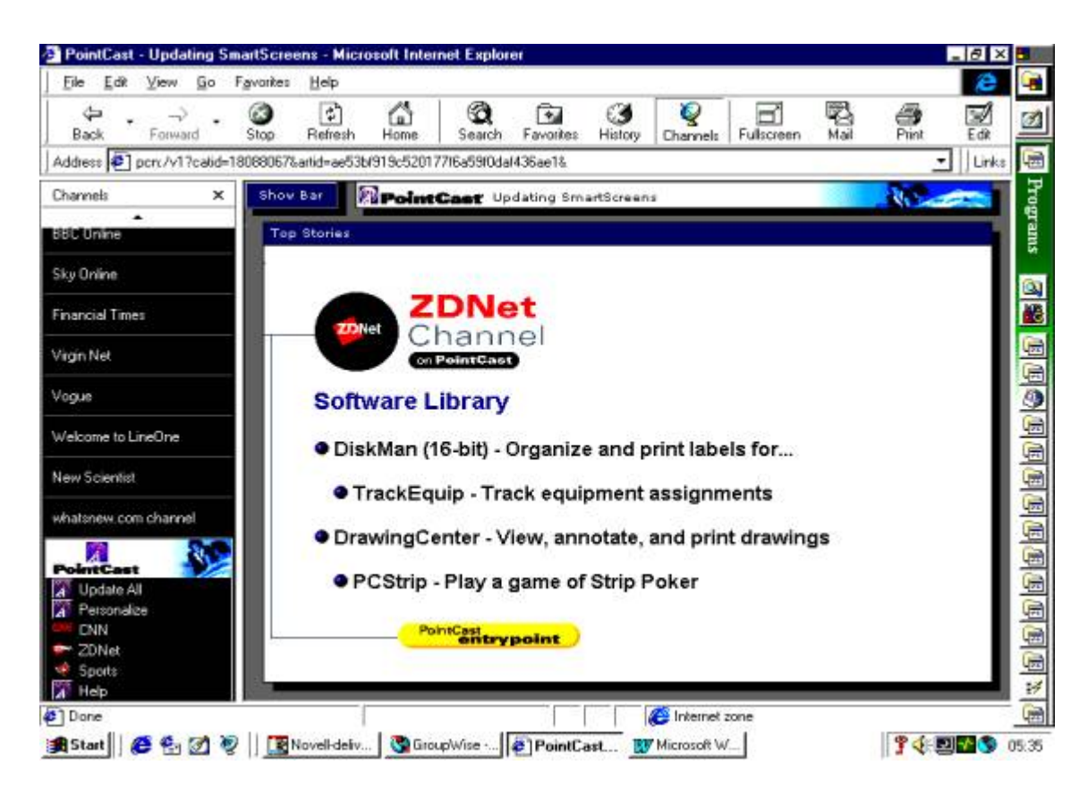
News Alert Service

News Alert (NewsAlert 1999) provides online access to news and market data via the Web. Users subscribe to the service by entering their own unique search profiles which News Alert Service saves in the subscriber's account. Subscribers are then presented with customised updates as soon as they log onto the News Alert site. A subscribers can also create a personal 'watch list,' that is, real-time monitoring of changes in, for example, specific stock markets and foreign exchanges statistics. Subscribers have an option to create their own personalised home pages that will launch every time they access the News Alert Service.