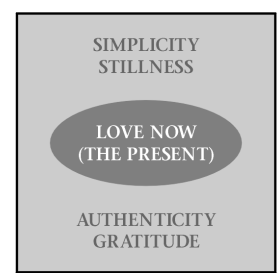
Figure 1: Smith's PiPL model of the journey from the ego self to spiritual being