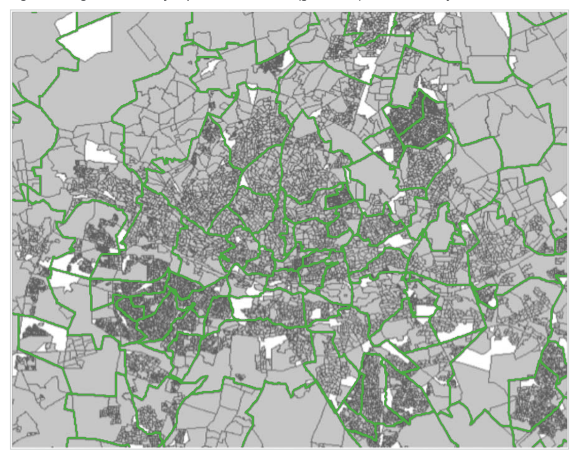
Figure 2: Image of the overlay of precinct boundaries (green lines) with the SAL layer

70% within precinct B, 30% of the population and all related census data are allocated to precinct A, and 70% of the population is allocated to precinct B. Adding up all the small areas and partial small areas within each precinct then gives us an estimated population per precinct.