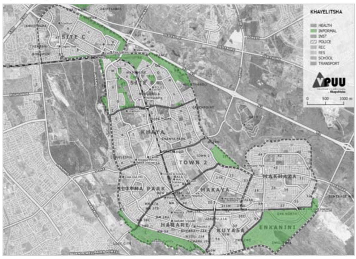
Figure 2: Map of Khayelitsha