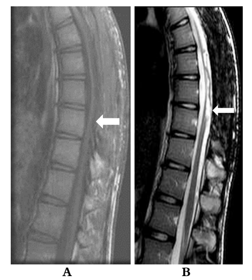
Figure 5 Thoracic pilocitic astrocytoma, six months postoperative A - T1 dye examination, image B - T2 image

No significant postoperative complications were recorded.