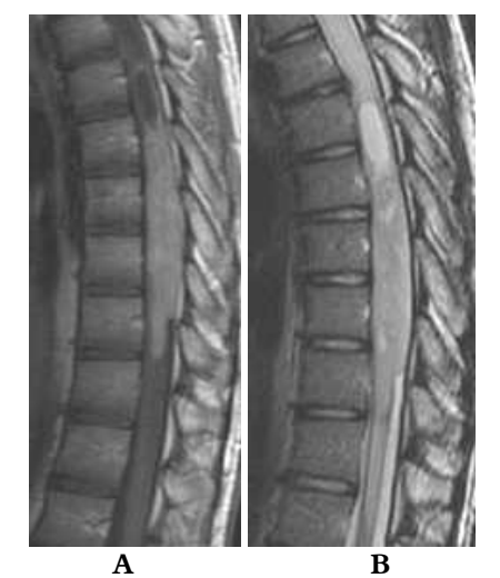
Figure 2 Thoracic pilocitic astrocytoma, preoperative