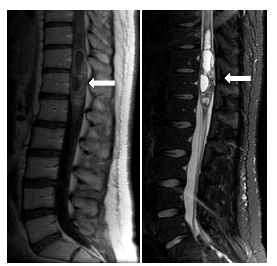
Figure 4 T1, sagital; T2, sagital Pilocitic astrocytoma

Biopsy was chosen as a temporary solution in two cases (13.33%), in which intra-operative cardiovascular disorders were recorded, the primary surgeon's decision was to minimize the duration of the intervention. Pathological results were pilocytic astrocytoma in one case and fibrillary astrocytoma in the other. A second intervention was scheduled within the first 14 days postoperatively performing the almost total ablation in the first case and the subtotal ablation in the second case.